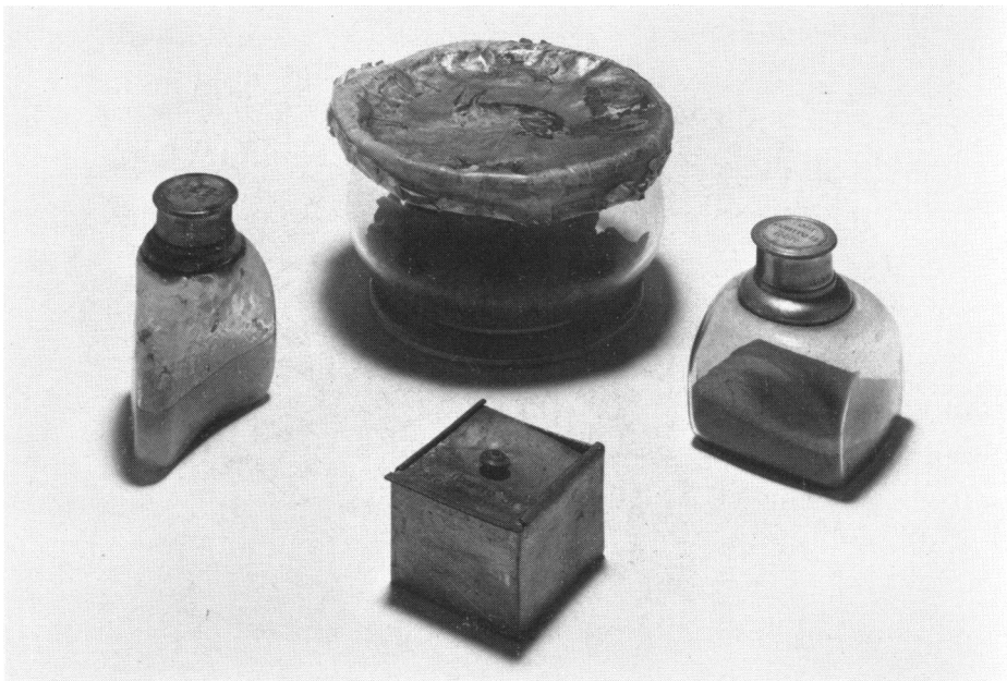
Figure 4. Four drug containers from the chest: bottles for Olio di cento anni and Polu: contro la febre , a pewter box for Estratto di Mechiocam , and a glass bowl with a parchment cover on which is painted a rabbit or hare.