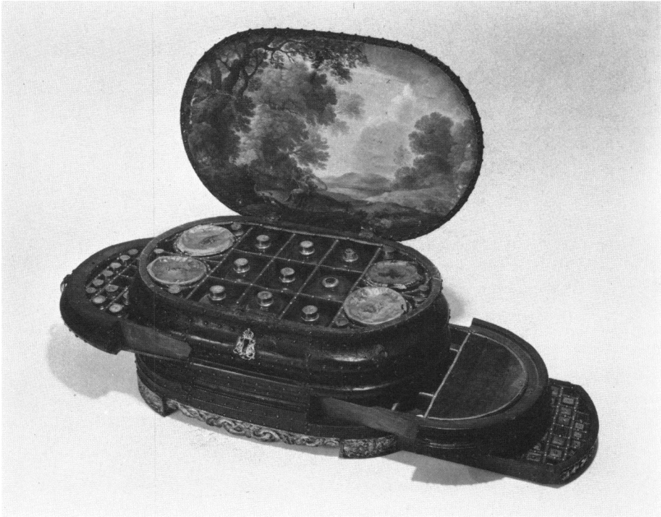
Figure 1. The Giustiniani medicine chest, c. 1565.