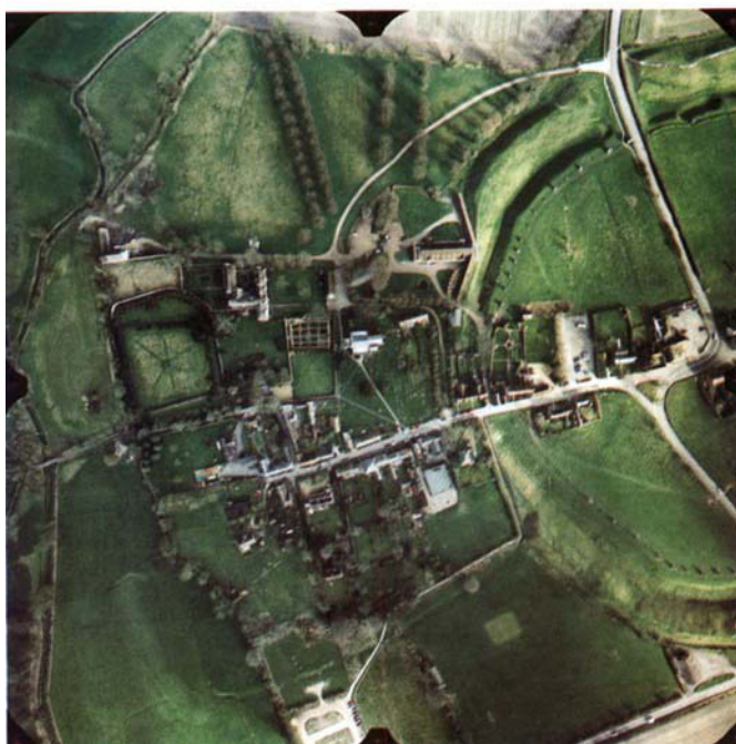
FIGURE 2. Vertical aerial photograph showing the proposed burh in relation to the Avebury henge.