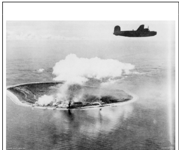
US bombing Nauru

On the night of 25 March 1943, less than three weeks after Takenouchi arrived on Nauru, 15 bombers from the US Army Air Force (USAAF) bombed the airstrip for the first time and destroyed eight bombers and seven fighter planes of the Japanese Navy.