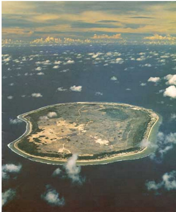
Nauru from the air

On 22 August 1942, eighteen Japanese planes bombed Nauru, and that night the cruiser Ariake bombarded the island from 3,000 meters offshore. Four days later, 100 Japanese soldiers led by Lieutenant Nakayama Hiromi landed on Nauru and occupied the island. 2