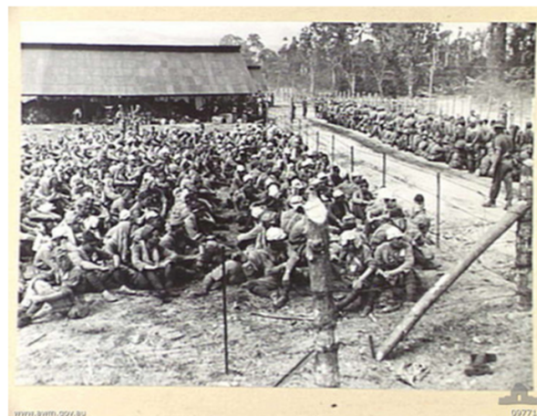
Surrendered Japanese soldiers