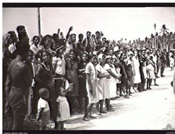
Nauruans attend flag-raising ceremony soon after Australian troops took over the island on 13 September, 1945

until November 1945 before all the Nauruan survivors were sent to Tol Island. They were finally sent back to Nauru by the BPC ship Trienza in January 1946. Father Clivaz survived the three year ordeal and repatriated to Nauru with the Nauruans, but Father Kayser died on Truk because of ill treatment by the Japanese. 35