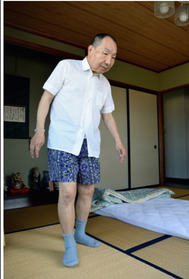
Hakamada Iwao pacing in his sister's house in 2014