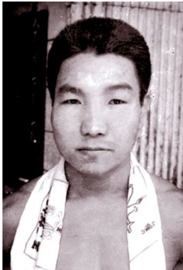
Hakamada Iwao before his arrest in 1966

some lessons that should be learned from this troubling and telling case study. Foremost among them is the need to reduce the level of denial about the possibility of wrongful convictions in Japanese criminal justice.