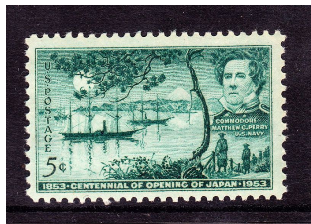
Commodore Perry Commemorative Stamp 30

In 1953, the U.S. Post Office issued a stamp commemorating the hundredth anniversary of the opening of Japan by Perry in 1853. The timing of this stamp is significant also for being released just a year after the end of the 1945-1952 Occupation of Japan. The design of the stamp incorporated the anchorage of American warships in Tokyo Bay and a portrait of Perry, with Fuji in the center and a samurai in the lower right.