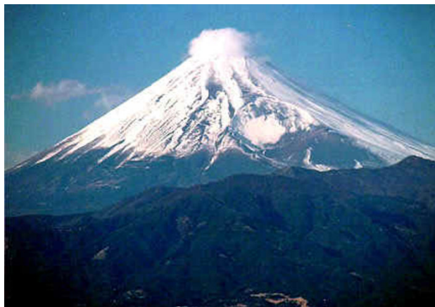
Mount Fuji 2

The exquisite shape of Fuji, its symmetrical triangle dominating a broad plain, has delighted the Japanese for two millennia, and pleased Western eyes for several centuries. Unlike the manmade symbols of other countries--the Eiffel Tower, the Statue of Liberty, and the pyramids of Egypt--this universally recognized sign for Japan is a natural landmark.