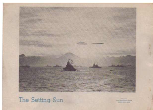
"The Setting Sun"

Such an adventurous challenge could not escape the attention of Hollywood. The periscope "capture" of Fuji was dramatized in the 1943 Warner film Destination Tokyo , which featured Cary Grant. The mostly fictional account has an American submarine land in Tokyo Bay to prepare for Doolittle's 1942 bombing of Tokyo. In the movie, when the periscope is raised to confirm their position, a huge Fuji appears right in front of them (as the soundtrack rises to a crescendo). This film uses Fuji as a marker for Japan both viewed through the periscope and from the deck of the submarine as a landing party goes ashore, and also in a brief aerial shot when Doolittle's planes begin their bombing run on Tokyo.