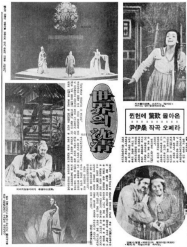
Figure 5: “Simch’öng in the World,” Kyöngnyang Sinmun , August 9, 1972.