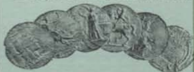
Gold Medal (Highest Award), Allahabad 1910.

GRANDS PRIX: Paris 1900, Brussels 1910, Buenos Aires 1910