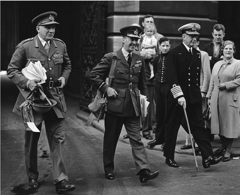
Figure 1.5 The Chiefs of Staff: Ironside, Newall, Pound

Chiefs of Staff as ‘weak and unconvincing’. 78 The reciprocal views of Pound and Newall about Ironside are not known. In the words of another historian, ‘continual consultation among the COS had not produced a better understanding among the services; familiarity with each other’s views had bred contempt rather than compromise’. 79