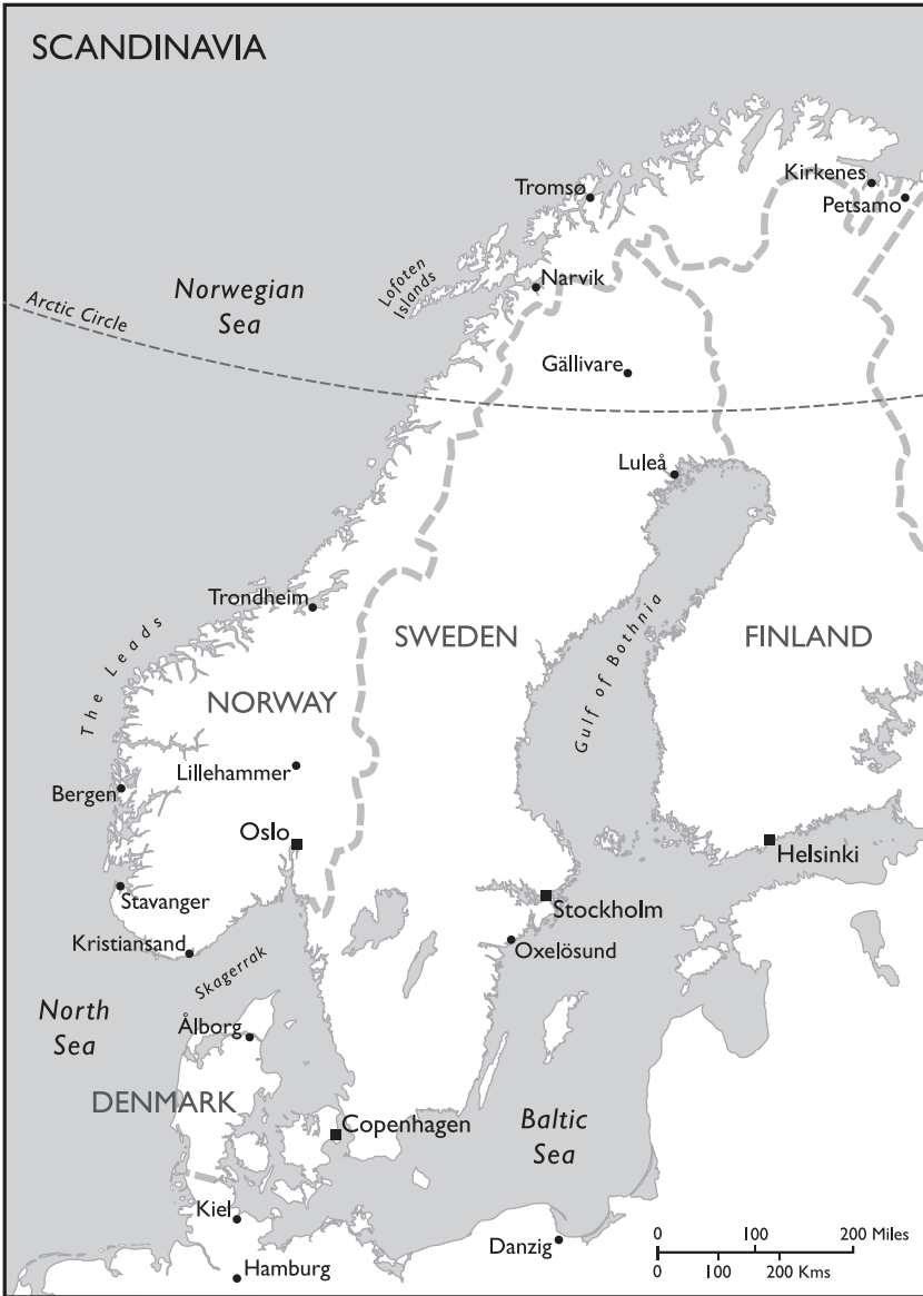
Map 1.1 Scandinavia

quantity of high-grade iron ore imported from Sweden. In addition, in April 1939 the Foreign Office had drawn the Admiralty's attention to a book published in Germany ten years earlier by a highly respected strategist, Admiral Wolfgang Wegener. The book emphasised the