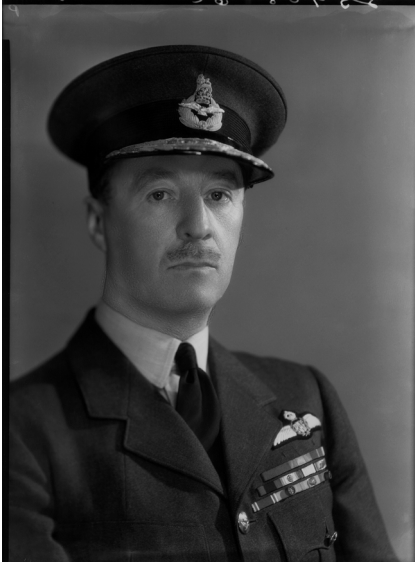
Figure 1.2 Air Chief Marshal Sir Cyril Newall ( National Portrait Gallery )

An interesting pen-picture of Newall is given by Marshal of the Royal Air Force Lord Slessor, a long-serving member of Newall's wartime staff. Given that Slessor was writing when Newall was still alive, it is necessary to read between the lines: