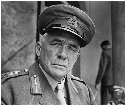
Figure 1.4 General Sir Edmund Ironside

I am not going to command the army in the field. My great ambition. I am not suited by temperament to such a job as CIGS, nor have I prepared myself to be such.’ 60 The appointment had been contentious within government, the more so since there was another strong candidate, Lieutenant General Sir John Dill. Ironside’s cause had received the significant support of Churchill (a friend, and something of a confidant ), 61 as Hore-Belisha told Ironside. 62 One factor in the decision, at least for Hore-Belisha, who cared about these things, was Ironside’s relatively high public profile. As one officer observed, ‘Ironside’s appointment was very well received. He was very much in the public eye at the time.’ 63