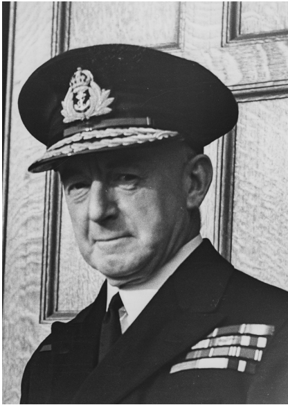
Figure 1.3 Admiral of the Fleet Sir Dudley Pound

members rather than attempting to offer wider or more personal advice or take the lead.