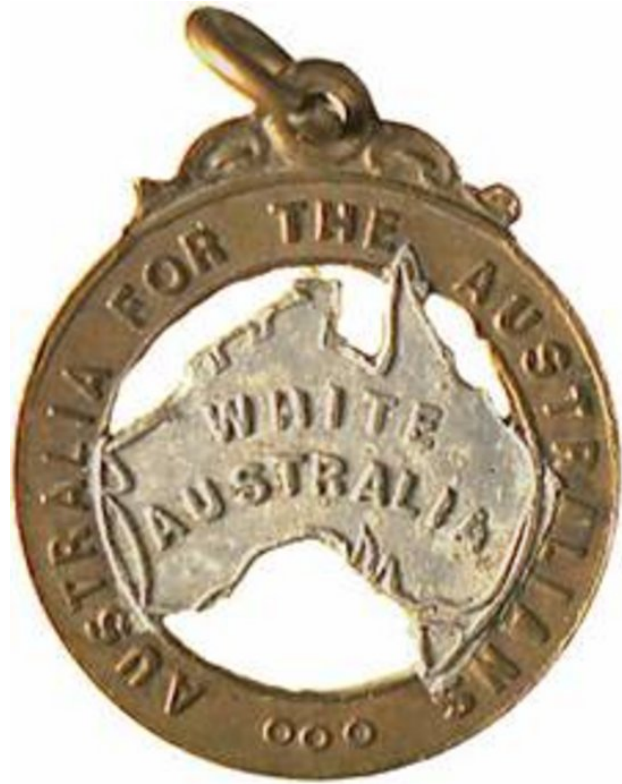
This badge from 1906 shows pride in “White Australia”

The logical extreme of the White Australian policy was manifested in the discussions among the governing elite (from the 1930s to 1950s) to “biologically absorb” and/or culturally assimilate the decidedly non-white Aborigine population, although for a long time the question of “where Aborigines fitted into the white nation was generally fudged or ignored for as long as they seemed headed for inevitable extinction.”[49] Ultimately, a policy of assimilation was adopted, but it was one that clearly reflected the then-prevalent and unequivocally racist discourse on the need to maintain national homogeneity (a “pure race”) as the source of national cohesion and national progress. Under Australia’s assimilationist policy (which was officially adopted in 1937, but not formally implemented throughout Australia until 1951), a conscious effort was made to exterminate Aboriginal culture; as part of this policy, children were forcibly taken from