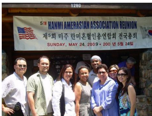
A membership meeting of Korean Amerasians, held in Fullerton, CA, May 24, 2009

There is, finally, an “endogenous” source of diversity: the children of international marriages. As the number of international marriages has increased, so too has the number of “multicultural children.” Amerasians, as I noted above, has been part of South Korea since the 1950s, but their numbers have always been relatively small due, in part, to overseas adoptions (and, of course, some emigrate to the United States with their American fathers).[29]