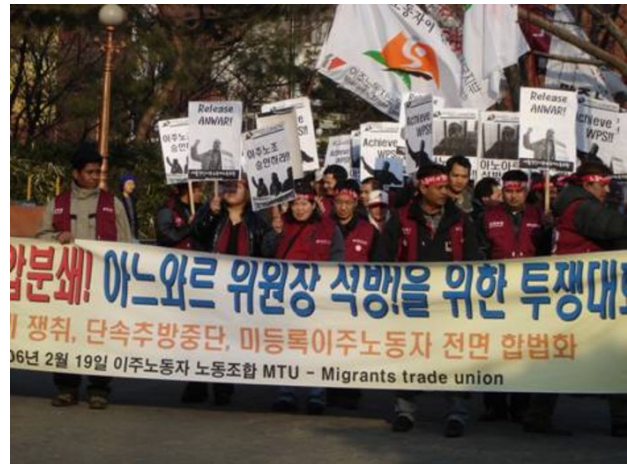
A protest organized by the Migrants Trade Union (MTU), an organization of foreign workers in South Korea, February 18, 2009

of Koreanness that determines who is, and who is not, classified as Korean.