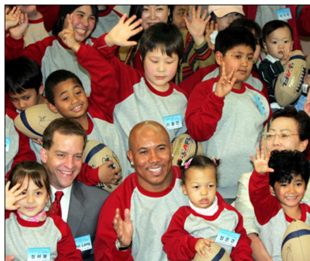
Hines Ward (bottom, center), on his visit to South Korea in April 2006, participates in an event held by the Pearl S. Buck International Foundation in Seoul

advertisements in Korea. Ward received a “hero’s welcome” on his first visit to his “motherland” in April 2006. The tacit, if unintentional, message underlying these stories was that neither pure blood nor culture is a necessary attribute of Koreanness. After all, Ward’s blood is “mixed” and he grew up in the United States where, as a young man, he learned almost nothing about his Korean heritage or Korean culture, including how to speak Korean. Ward’s embrace, it is important to emphasize, was different from that of other Amerasians or “mixed blood” entertainers or sports figures in South Korea (as well as in Japan and other Asian countries): he sparked a significant national debate on Korean identity and the country’s “shameful” history of discrimination. Even more, Ward’s success provoked a number of immediate policy changes. Shortly after his visit to South Korea, for example, the Ministry of Education announced that middle school textbooks would no longer describe Korea as a “nation unified by one bloodline,” but instead speak of “a multiethnic and multicultural society.”