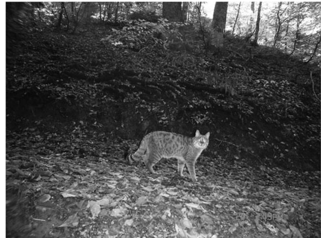
PLATE 1 Camera-trap photograph of a wildcat in Yaylacık Research Forest (Fig. 1a).

The camera-trap survey documented the wildcat in the Yaylacık Research Forest (Plate 1). We obtained 402 records of animals of which 22 were of wildcats and 13 were appropriate for individual recognition. Relative abundance