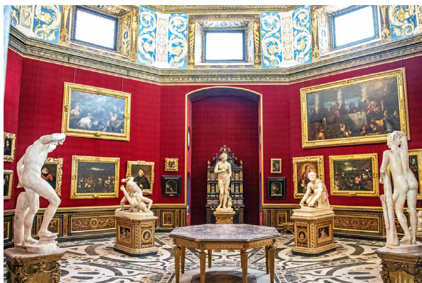
Figure 1.2 Bernardo Buontalenti, The Tribuna (1581–1583). The Wrestlers (deep left); Venus de' Medici (center); The Listening Slave (deep right). The Uffizi Gallery, Florence, Italy.

example of proportion, taken on tours in travel guides as a standard of excellence, and insistently included in novels and poems. 16