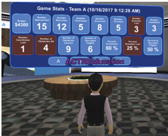
Fig. 2. Screenshot of the debrief room. After completion of the game, team performance metrics are displayed and discussed in comparison with other teams.

Learners can compare their outcome with other teams, introducing competition to increase engagement. The teams can play multiple times and experiment with different communication and teamwork strategies in order to improve their performance.