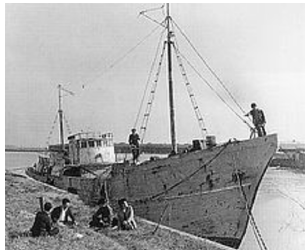
The Lucky Dragon #5 in 1954

The Lucky Dragon #5 was a wooden ship listed at 99.09 tons. Her actual weight was 140 tons. At the time, wooden ships were limited to 100 tons. So the ship weighed 99.09 tons to meet the limit, then inspectors were bribed and 40 tons added. Come to think of it, she was a scary ship. She was eighty-three feet long, nineteen feet at her beam, and drew eight feet.