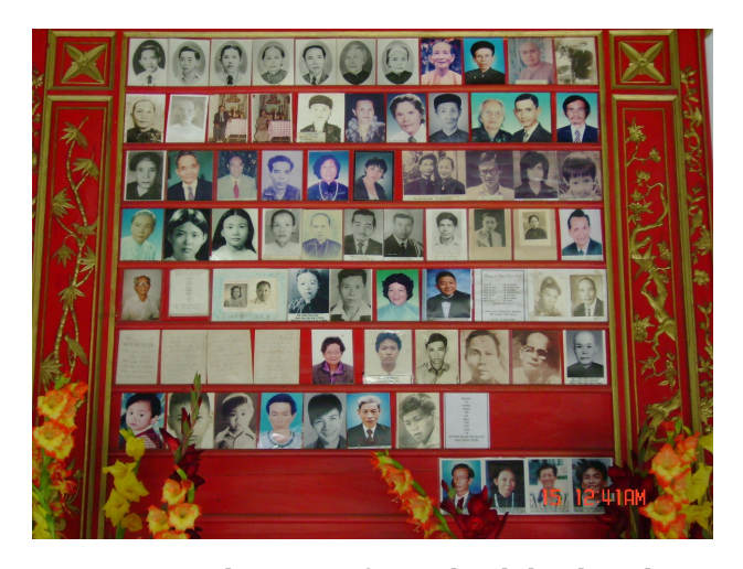
Pictures and names of war dead displayed in the back of a Buddhist pagoda, Quang Nam.

The cruel history of the Cold War is not a thing of the past in the villages that survived the war. The historical identity of the village still fluctuates in the violent memory of night and day, and between the hero and victim identities that together perpetuate this irreconcilable contradiction. In this double historical memory, Ha My and My Lai were both VC and "No VC" villages. Each harbored 80 percent cach mang (revolutionaries) and 20 percent Vietcong subversives. Pride and stigma, and honor and terror, tail one another and keep alive the magical realism in which a village is both VC and "No VC." Likewise, the collective identity of the victims of the village massacres remains unclassifiable. The victims were "simple villagers," and they were not. They were "heroic defenders of the native land," and they were not.