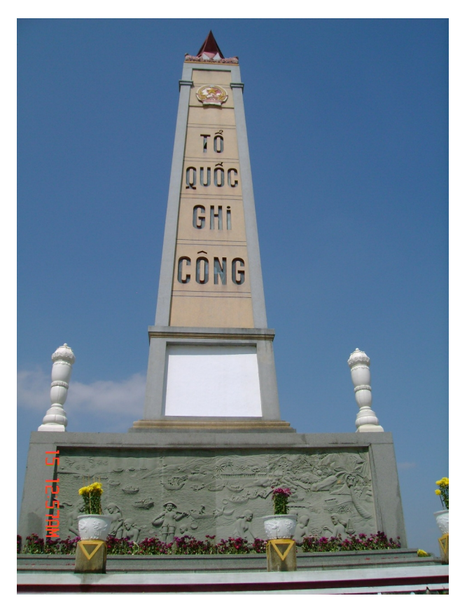
Memorial for revolutionary martyrs, with the inscription "Your ancestral land will remember your sacrifice."

skeletons were taken to the sand dunes or to the distant bamboo forest and buried there. This hasty, collective reburial precluded any accompanying traditional rituals. The reburial of the victims was improper, in the view of many ordinary Ha My villagers, and it has been a source of great shame and pain for the survivors. While these mass graves were evacuated as village land was prepared for agricultural production, the individual tombs of fallen revolutionary combatants took their place at the center of the village. The latter was to become a prime symbol for the nation's unity and for its victorious past and prosperous future.