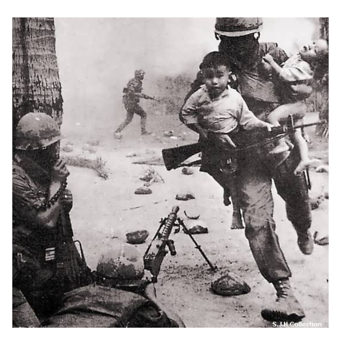
ROK soldiers helping children evacuate.