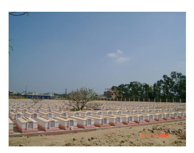
Local cemetery for fallen revolutionary combatants.