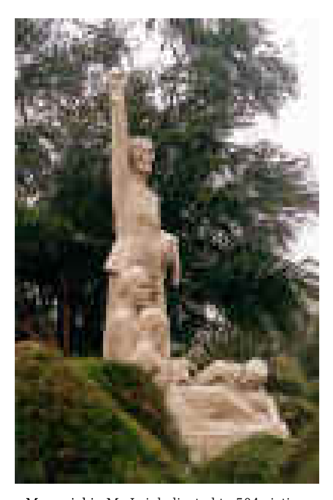
Memorial in My Lai dedicated to 504 victims of the 1968 massacre, including 135 victims from the Tu Cung village.

however, could turn into devastating misfortune. The apparent relative safety of a village frequently led to tragedy of greater proportions. The "safe village" and the "return village" could turn into a site of mass death when the identity of the village suddenly shifted and it became a "VC village" circled in red on the battle map. This shift in identity was abrupt, unknown to the inhabitants, outside their control, and often, in fact, outside the control of the armed combatants on both sides.