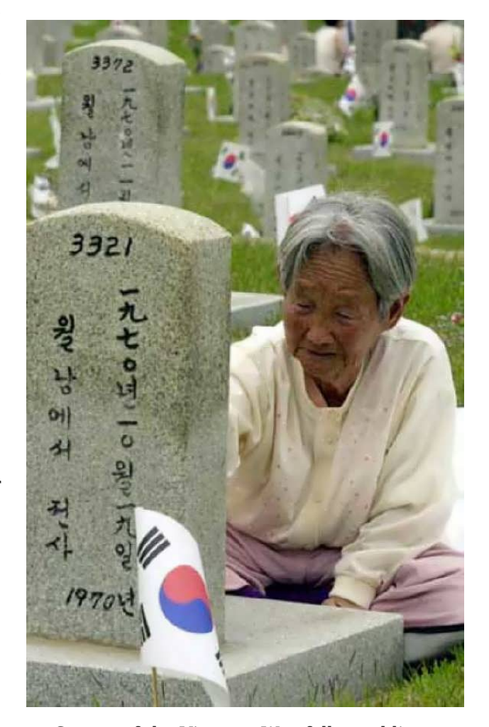
Graves of the Vietnam War fallen soldiers, National Cemetery of South Korea.