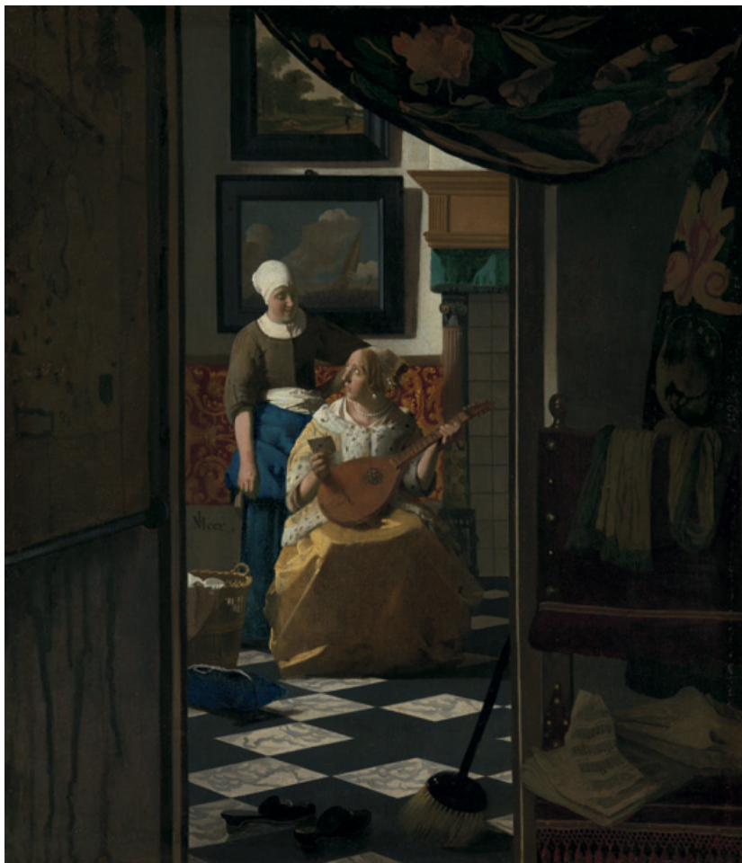
Figure 1 Johannes Vermeer, ‘The Love Letter’ (c.1669–70), Rijksmuseum

here, but the curiousness of the image does not settle onto one interpretation alone. 2