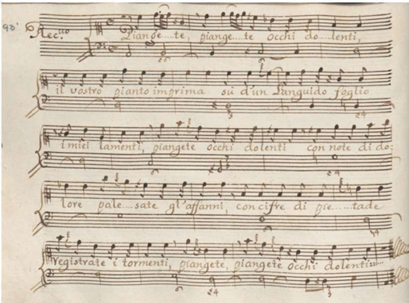
Figure 9 Domenico Scarlatti, ‘Piangete, occhi dolenti’ (after 1730), Österreichische Nationalbibliothek, Mus. Hs. 17664, f. 93 v

succession by the same singer. It would be logical to have one singer representing each of the characters in cantatas, but the texts themselves ventriloquize the voices of the other enough that such strict dramatic delivery or demarcation is not necessary in this context. In contrast to earlier lettere amoro se, the clear stylistic alternation between recitatives and arias naturally creates a kind of exchange that in a way functions in the place of actual letters that the singers may be ‘writing’. The lettera amoro sa is, as we have seen, an opportunity to perform multiple perspectives at once and to transform, as the inky tears of the opening passage of ‘Piangete, occhi dolenti’ do, the unseen physical tokens of grief into the legible symbols for an absent lover. As in all lettere amoro se, the music strives to overcome both time and space: the absent becomes present, voices are commingled, and the past is manipulated in the present.