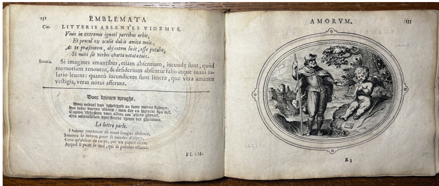
Figure 3 Otto van Veen, Amorum emblemata (Antwerp, 1608), pp. 132–33, David M. Rubenstein Rare Book and Manuscript Library, Duke University.