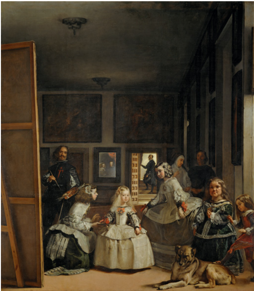
Figure 2 Diego Velázquez, 'Las Meninas' (1656), Museo del Prado

The early history of musical letters is extensive and spans several centuries and genres. 27 Nearly all the musical scholarship on the topic of the lettera amorosa has been centred on or oriented towards the love letters of Claudio Monteverdi. But the lettere amoroze of the seventeenth century were neither the beginning nor the end of this rich tradition of singing letters. The provocative