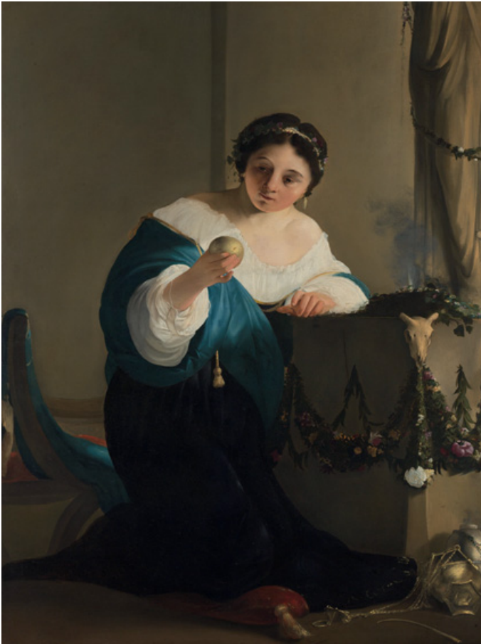
Figure 4 Paulus Bor, ‘Cydippe with the Apple of Acontius’ (c.1645–55), Rijksmuseum

The mythological story of Cydippe and Acontius is a paradigmatic tale for the use of letters to exercise power over the voice of another (see Figure 4). The story survives in three primary sources, as discussed in detail by Patricia