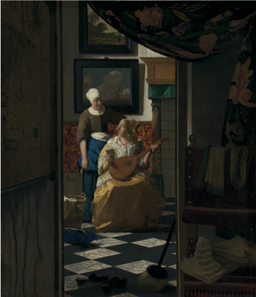
Figure 1 Johannes Vermeer, ‘The Love Letter’ (c.1669–70), Rijksmuseum

here, but the curiousness of the image does not settle onto one interpretation alone. 2