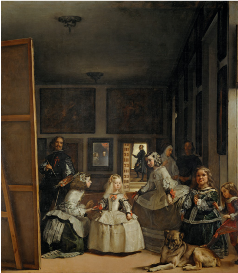
Figure 2 Diego Velázquez, 'Las Meninas' (1656), Museo del Prado

The early history of musical letters is extensive and spans several centuries and genres. 27 Nearly all the musical scholarship on the topic of the lettera amorosa has been centred on or oriented towards the love letters of Claudio Monteverdi. But the lettere amoroze of the seventeenth century were neither the beginning nor the end of this rich tradition of singing letters. The provocative