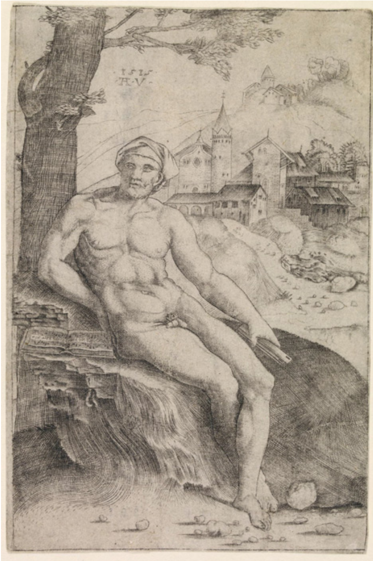
Figure 6 Agostino Veneziano (after Baccio Bandinelli), ‘Male Nude with Music Book’ (1515), The British Museum

Her quotation of his untruthful and misleading words would be a kind of retaliation in performance, as his receiving voice is the one forced to utter them.