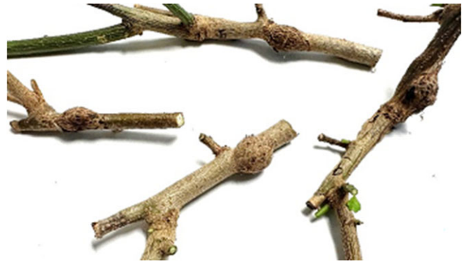
Figure 3. Galls on Schinus terebinthifolia stems 6 mo after inoculation from cultured mycelial mats placed onto stem abrasions.

Small galls (~5 mm) first became apparent on roughly 20% of plants 2 mo after plants received the purified hyphal inoculum. By