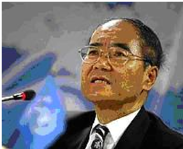
UNESCO Chief Matsuura Koichiro

Under this new policy of strengthening cultural exchanges, Japan began to provide financial and technical assistance to preserve cultural heritage abroad. In 1989, a trust fund with Japanese financial contributions was established within the Paris-based UNESCO. Japan has chipped in a few million U.S. dollars annually for the Japanese trust fund for the preservation of world cultural heritage.