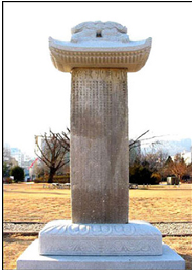
The Bukgwandaecheopbi, taken by Japanese soldiers in 1905, was returned to North Korea last year.

Korean militia leader Jeong Munbu's victory over Japanese warlord Toyotomi Hideyoshi 's invading forces in the late 16th century and seized in 1905 by Japanese Imperial Army troops during the Russo-Japanese War from what is now North Korea, was returned to North Korea via South Korea.