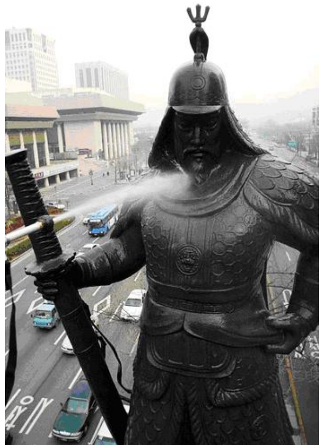
A worker cleans a statue of Admiral Yi Sun-shin in Gwanghwamun, Seoul on March 19, 2006. Yi was a late 16th century Korean hero who vanquished Japanese naval forces in several key engagements during Japanese warlord Hideyoshi's invasion of Chosun.

Meanwhile, Japan also remains dogged by negative legacies of its militaristic history. The question of who are the rightful owners of cultural properties is not a thing of the past in uneasy relations between Japan and its Asian neighbors, which suffered Japanese aggression or colonial rule during and before World War II.