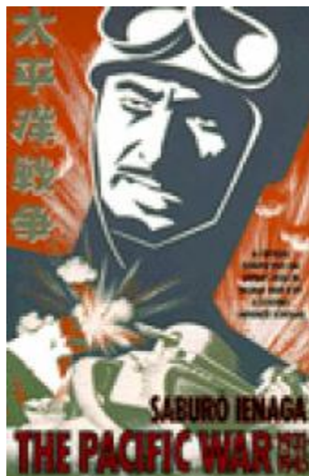
Ienaga Saburo's The pacific War .

This change of emphasis symbolizes the most substantial advance in official policy vis-à-vis wartime atrocities over the last twenty years. In the contentious debate over textbook content, Tokyo now officially recognizes the historical reality of most Japanese war crimes: the Nanjing massacre, comfort women, mass suicide in the Battle of Okinawa, etc.[70] On the issue of biological warfare, the Ministry of Health and Welfare confirmed the existence of Unit 731 in the cabinet committee of the National Diet in April 1982.[71] And the Japanese Supreme Court recognized the legality of references to Unit 731 in textbooks in the final ruling of Ienaga Saburo's third lawsuit in 1997.[72]