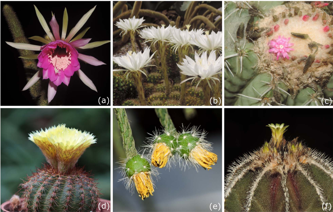
PLATE 2 Some of the threatened species in the Rio de Janeiro Botanic Garden Cactarium (Plate 1): (a) Arthroocereus rondonianus, (b) Echinopsis calochlora, (c) Melocactus glaucescens, (d) Parodia ottonis, (e) Rhipsalis pilocarpa, (f) Uebelmannia pectinifera.