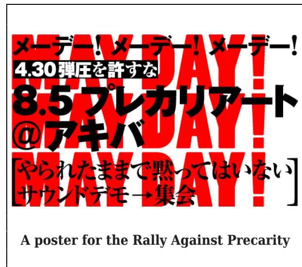
A poster for the Rally Against Precarity

precarity hit the lower strata of society and youth especially hard, leading to increased suicide, divorce, non-marriage, deflation and lower productivity because firms no longer invest in training disposable workers. In this acute social crisis, political leaders sought to divert attention to “external enemies.”