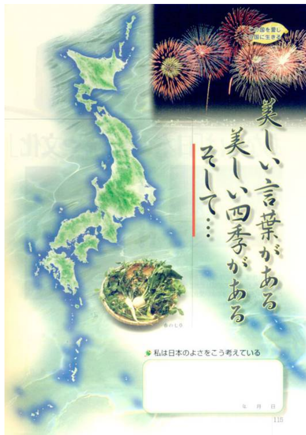
“Cultivating a Love of Country” / “Beautiful Language, Beautiful Seasons”