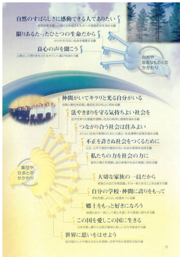
“The 23 Keys to life”