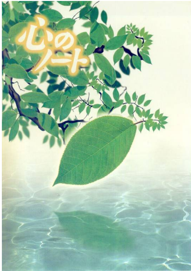
Cover of Kokoro no Noto