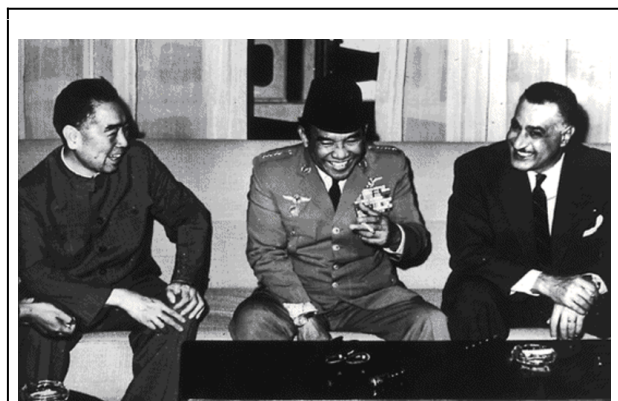
Zhou Enlai, Sukarno and Nasser at Bandung conference

Japan’s anti-white racial solidarity propaganda during the Greater East Asia Co-Prosperity War (1937-1945) was quite influential in damaging the credibility of European empires all over Asia, but especially in Southeast Asia, which Japan temporarily ruled over. Office of Strategic Studies reports emphasized the impact of this propaganda and recommended that the US never advocate a restoration of white Western empires in the region.