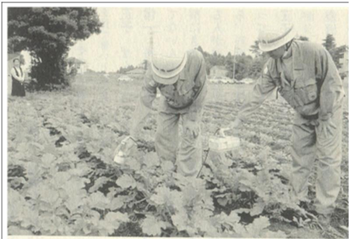
Figure 2: Officials monitor radiation levels at a radish field, 1km away from the Tokaimura plant (12.2.1999)