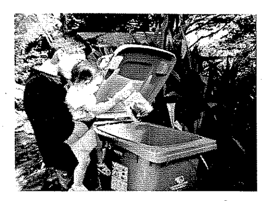
FIGURE 2: Recycling as an everyday environmental education experience

The other area is composting. We have our own garden, we are putting out vegetables, the children are actively doing it, and we eat the vegetables at the end of the process! "How do the vegetables develop from here to there? And what is that? And what is the compost doing?" Because it happens in there, where they can't see it, so we