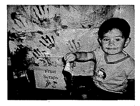
FIGURE 1: Composting the fruits scraps as an everyday environmental education experience

see knowledge as contextually bound and determined by social practices. From this perspective the "what" (or content) of early childhood curricula should be informed by the cultural experiences shared and generated by children and adults within a given early childhood educational setting. Accordingly, an issue of concern in early childhood curricula research is the role content knowledge holds in a field of education characterised by beliefs about education that focus on learning from a socio-cultural perspective (Hedges & Cullen, 2005). In other words, if learning is described as socially generated and situated how is the actual content informing the learning experiences offered to young