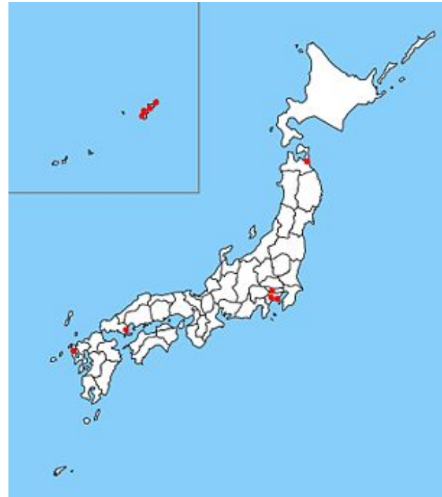
US bases in Japan

The excessive concentration of the USF and US military bases in Okinawa has created different perceptions of the US bases in the Japanese mainland and on Okinawa. This is why many Japanese citizens can ignore various problems arising from the US bases on Okinawa and adopt an attitude of 'it's none of our business'.