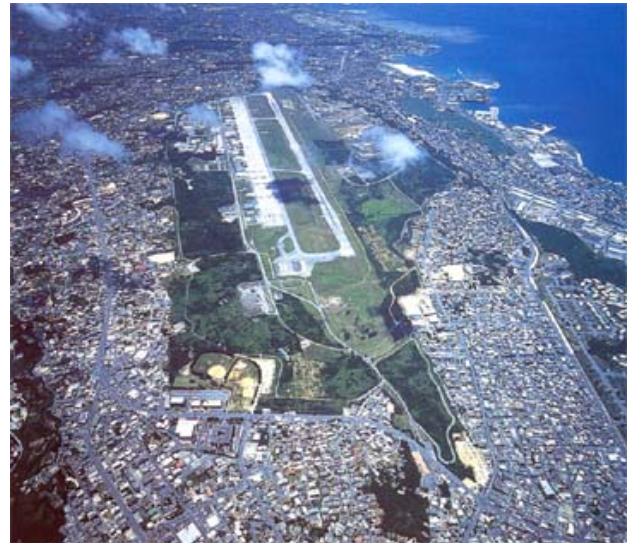
Futenma Base in crowded Ginowan

When a US transport helicopter from Futenma Marine Corps Air Station crashed at the Okinawa International University campus (2004), despite this taking place outside the base, the US military acted as if Japan was its occupied territory and closed off the accident site, thus disrupting the work of Japanese police and fire fighters. On top of this, it was the Defense Agency's Naha Facilities Administration Agency (now the Ministry of Defense, Okinawa Defense Administration Agency) that repeatedly apologized over the accident and paid compensation for the damage to the university.