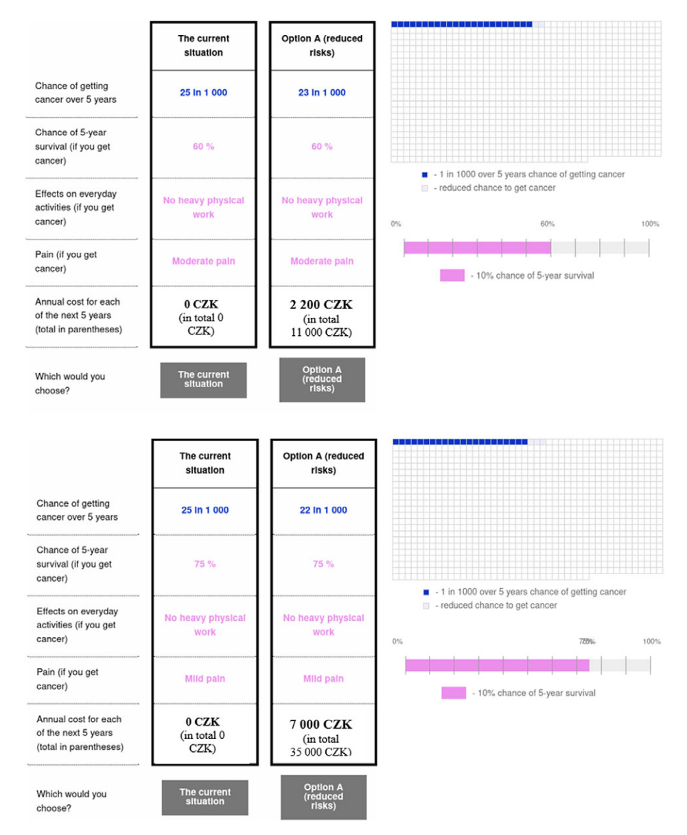
Figure 1. Sample choice card from Wave 1 (top) and Wave 2 (bottom).