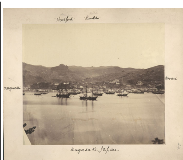
Nagasaki port 1871 with British and American ships

From the 1850s onward, innovations in marine technology in the form of steam-driven ships and the expansion of land and submarine telegraphic communications firmly incorporated Japan into the European-based networks of power and exchange. 10 The Tokugawa authorities signed commercial treaties under duress with the United States, the Netherlands, Russia, Britain, and France in 1858. As a result, the ports of Kanagawa, Nagasaki, and Hakodate were opened to foreign trade. Trading privileges were extended to foreign merchants in 1863 to include the ports of Niigata, Hyogo, and the cities of Edo and Osaka. The increase in steamers calling to ports in Japan also saw the demand for coal soar. 11 Encouraged by the demand for coal by energy-hungry steamers, the Japanese government investigated ways in which Kyushu coal mines could be exploited for nation-building. 12 The Meiji government invested heavily in the development of the Takashima and Miike mines in western Kyushu on the calculation that coal exports were a lucrative source of badly needed foreign exchange.