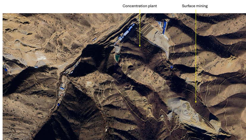
Figure 4.2.2 Aerial view of Ishtamberdy mine

tons of gold. 20 This assessment places the Ishtamberdy mine among the larger of Jalal-Abad mines, whose gold deposits range from 34 tons (in Bozymchak) to 170 tons (in Chaarat). However, when compared to the Kumtor mine in the east, Ishtamberdy's deposit is considered relatively small, 21 containing approximately a quarter of Kumtor's 538-ton deposit.