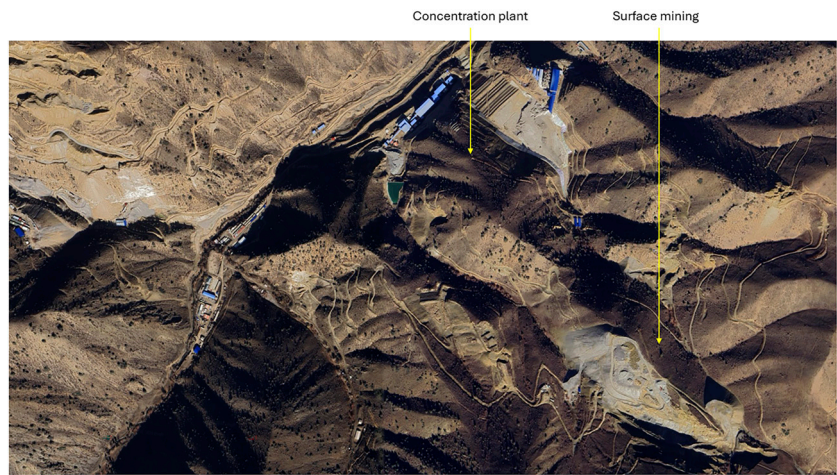
Figure 4.2.2 Aerial view of Ishtamberdy mine

tons of gold. 20 This assessment places the Ishtamberdy mine among the larger of Jalal-Abad mines, whose gold deposits range from 34 tons (in Bozymchak) to 170 tons (in Chaarat). However, when compared to the Kumtor mine in the east, Ishtamberdy's deposit is considered relatively small, 21 containing approximately a quarter of Kumtor's 538-ton deposit.