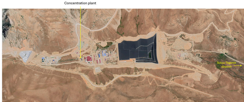
Figure 4.2.3 Aerial view of Kulu-Tegerek deposit at Kichi-Chaarat mine