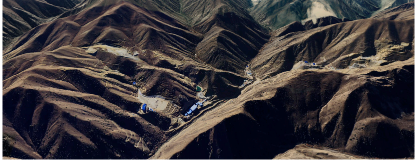
Figure 4.2.1 Tilted view of Ishtamberdy mine