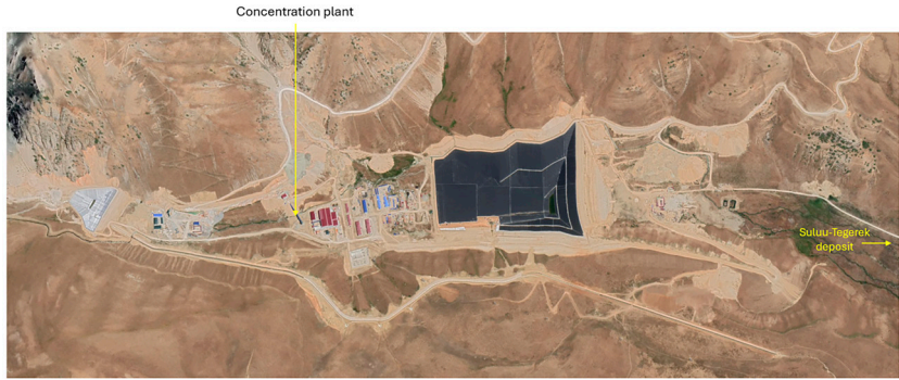
Figure 4.2.3 Aerial view of Kulu-Tegerek deposit at Kichi-Chaarat mine