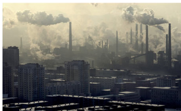
China coal-fueled steel production at Benxi

dioxide. Burning coal releases massive amounts of mercury and other pollutants into the environment. Clean coal technology in power production is not going to remove these pollutants. Theoretically of course, it is possible to develop all kinds of apparatuses to remove these pollutants from the emission stream of coal combustion. But the more one removes pollutants and particulates from the emission stream, the more costly is coal-fired power per kilowatt hour. Coal’s only strong points are that it is cheap, is already a major source of power, and there are plentiful reserves outside the OPEC countries. Raise its per kilowatt-hour cost, and it loses its main advantage to the truly clean energy sources, notably wind and solar, that are already at or close to grid parity (equivalent per kilowatt-hour generation cost) with it.