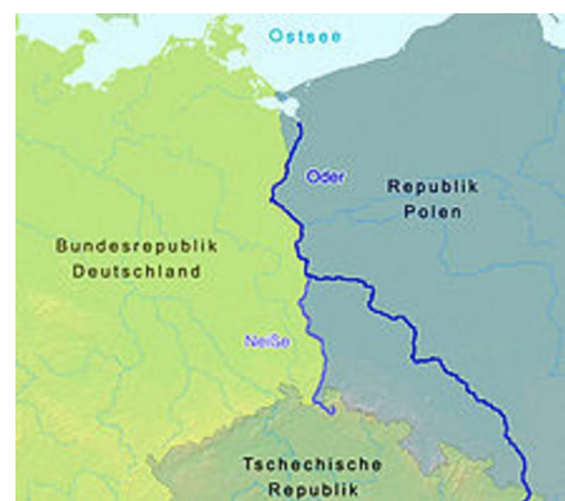
The 1970 Warsaw Treaty between Germany and Poland settled outstanding border issues with the Oder-Neisse line

Other agreements recognizing historical grievances followed: 1972 diplomatic relations; 1990 Border Treaty; 1991 Good Neighborliness and Friendly Cooperation Treaty; 1972, 1975 and 1991 compensation payments (without calling them restitution to individuals or reparations to the state); 2000 agreement on slave and forced labor (with Poland providing roughly one quarter of the recipients and receiving approximately one quarter of the funds). The Polish case demonstrates that some issues of history can be frozen and revived only years later, mirroring the German-Israeli case; for example, it was only in 1965, thirteen years after the 1952 Reparations Agreement, that diplomatic relations were concluded between Germany and Israel. In the Czech case, victims of Nazism received their first compensation from Germany only in 1997.