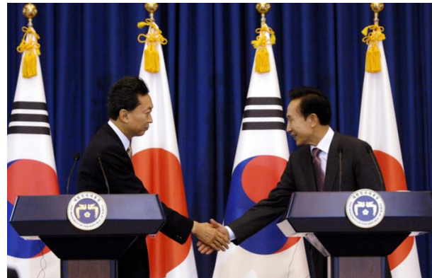
Hatoyama (left) and Lee in Seoul, October 9, 2009

As scholars and practitioners have sought to understand the power of history issues in Asia and the possibilities for ending the logjam over reconciliation, in the last decade many have looked to Germany's experience with a foreign policy of reconciliation. The literature on Northeast Asian