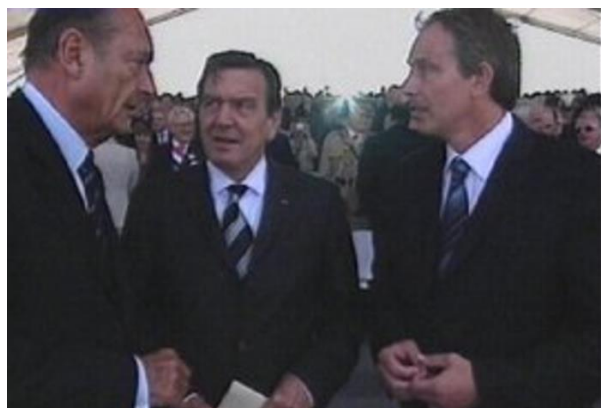
Chirac, Schröder and Blair at D-Day Ceremony

The second set of activities dealing on a regular basis with the past, but in an affirmative way, are the actions of various civil society organizations. There are too many to enumerate, but we can identify three that are present in the Polish case and across the other three cases: the bilateral textbook commission, the Action Reconciliation/Service for Peace ( Aktion Sühnezeichen/Friedensdienste ) and the German Historical Institute. Neither Israel nor the Czech Republic has the latter in formal terms, but they do have some equivalent: the German-Czech Historians Commission ( Deutsch-Tschechische Historikerkommission ) and the Institutes of