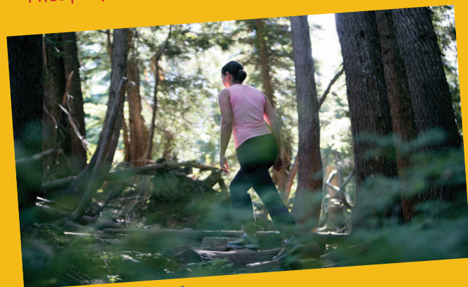
Grouse Grind® Hike Monday, June 3, 2013 • 14:00 - 17:00 Price per person: $69 - Min: 22 people / Max: 48 people

For more information on these events please view www.caep.ca/Conference