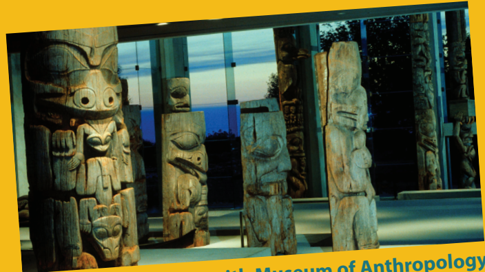
Vancouver City Tour with Museum of Anthropology Monday, June 3 • 14:00 - 17:30 Price per person: $89 - Min : 25 people / Max : 48 people