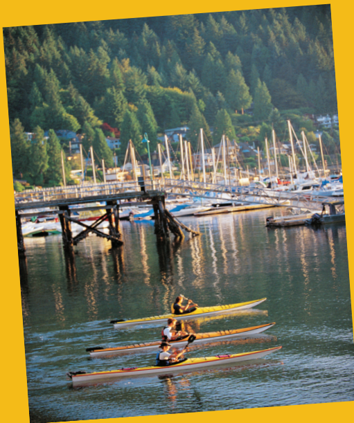
Vancouver Kayaking Deep Cove Explorer Monday, June 3, 2013 • 14:00 - 17:30 Price per person: $129 Min : 20 people / Max : 50 people