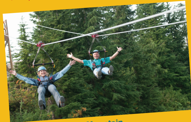
Ziplining on Grouse Mountain Monday, June 3, 2013 • 14:00 - 18:00 Price per person: $179 - Min / Max : 22 people