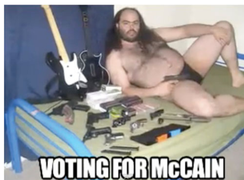
Figure 2c. Man with guitars and guns votes McCain. Video still from “Obama Dirt off Your Shoulder Remix.” YouTube video, uploaded 18 April 2008 by jarts (no longer available).

gun-toting rednecks support McCain (Figure 2c). With these images, the creator unabashedly constructs racial and gender (and even class) stereotypes: black men have rhythm, feminists are angry, and poor whites cling to their guns. He also pairs images of “heroic” gangstas (including Obama) with images of objectified women and positions the viewer/voter as both a witness to the unfolding spectacle and a potential arbiter of taste: flat-chested women support Clinton, and voluptuous women endorse Obama (in this case, Natalie Portman and Scarlett Johansson, respectively). Using a hip hop-influenced filmic aesthetic, images are appropriated, recontextualized, and collaged to create a counter-narrative within campaign discourses—in this narrative, Obama becomes a “real” hip hop icon. He has the smooth moves, the superhuman status, the decorative women, and no one can stand in his way. 40