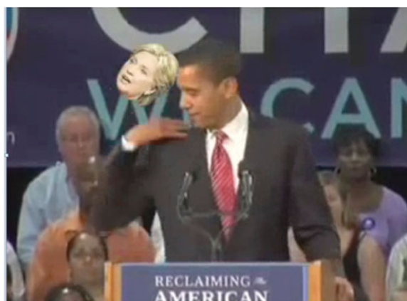
Figure 1. Obama brushes a superimposed image of Hillary Clinton’s head from his shoulder. Video still from “Barack Gets That Dirt off His Shoulders.” YouTube video uploaded 17 April 2008 by Bill3948, http://www.youtube.com/watch?v=yel8IjOAdSc .

standard and its artist, but also forms an alliance with the genre and its community by appropriating and recontextualizing a message in the song that he could agree with—that is, the choice to confront hostility in a non-aggressive manner. 36 And as the candidate wittily demonstrates, a decision to take the higher ground can be made in the realm of politics, just as it can on the street. By appropriating this symbolic gesture, Obama embraces the respectable side of street culture while he remains removed from the actual language of the song—and rejects the more nefarious aspects of street life: crime and violence. 37