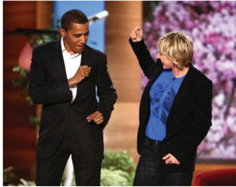
Figure 2a. Obama dances with Ellen DeGeneres. Video still from “Obama Dirt off Your Shoulder Remix.” YouTube video uploaded 18 April 2008 by jarts (no longer available).