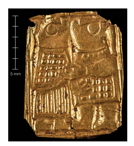
Figure 7. Foil figure 303, die-identical to the Svintuna figure. Die family Daisy.

goldsmiths travelling between sites with their dies (cf. Axboe 2012; Pesch & Helmbrecht 2019b; Löfving 2020: 55). A small fragment of embossed silver foil found with the gold-foil figures at Aska is possibly from a silver-foil figure similar to those found in small numbers at Sorte Muld (Watt 2019: 36).