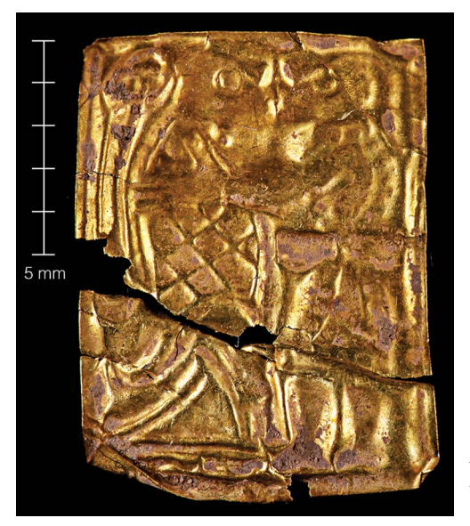
Figure 4. Foil-figure 306, shown from the reverse side, die-identical to the Husby in Glanshammar figure. Die family Adam.