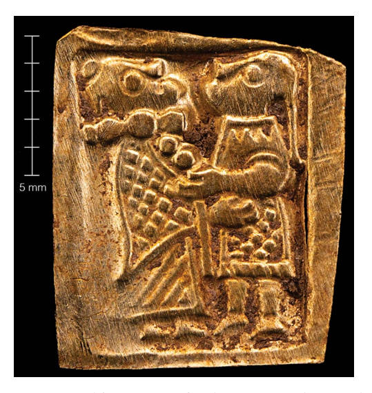
crack to the right, from the embossing.

goldsmiths travelling between sites with their dies (cf. Axboe 2012; Pesch & Helmbrecht 2019b; Löfving 2020: 55). A small fragment of embossed silver foil found with the gold-foil figures at Aska is possibly from a silver-foil figure similar to those found in small numbers at Sorte Muld (Watt 2019: 36).