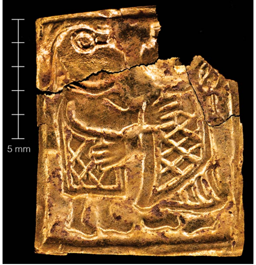
Figure 6. Foil figure (in two fragments) 5+8, Figure 8. Foil figure 12. Die family Daisy. Note the vertical die-identical to Borg in Lofoten figure 8334. Die family Carl.