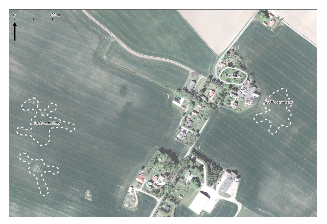
Figure 1. Aerial view of Aska hamlet with building platform and ploughed-out cemeteries. The latter's dashed boundary lines are based on Middle Viking Period metalwork scatters in the plough soil (figure by Jon Lundin).

Excavations on the platform in 2020–21 (Rundkvist 2021; Rundkvist & Lindgren 2022) revealed that the postholes had been robbed of their large packing stones and almost all cut features were backfilled with cobbles and what seemed to be the former floor layer of the hall. It produced a large assemblage of small bone fragments and artefacts (see online supplementary material (OSM)). The platform hall cannot have been the only building at this manorial settlement: future fieldwork will help to establish the full nature of the site.