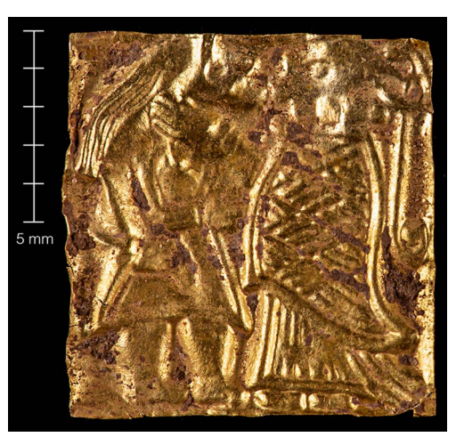
Figure 5. Foil figure 308. Die family Betty.

of the foil as also found in contemporaneous animal art. The large identical group found at Aska is new: embracing couples have not previously been recognised in