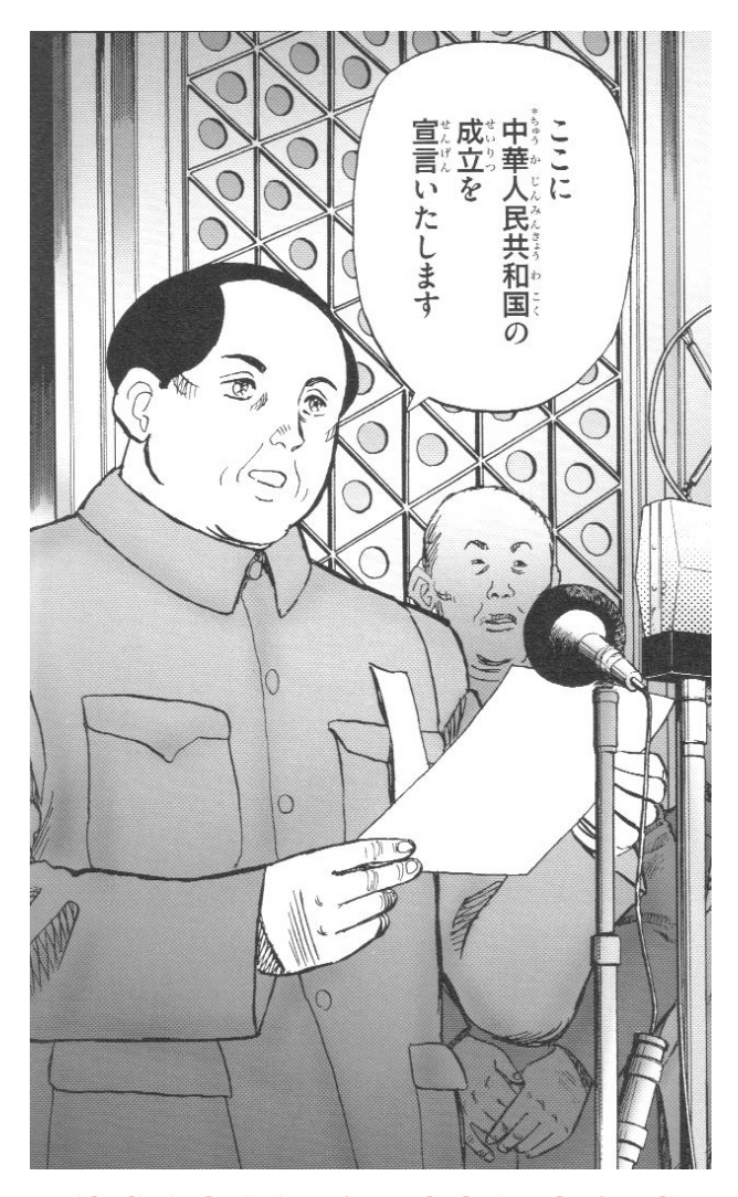
An idealistic depiction of Mao declaring the founding of the People's Republic of China in Chugoku no rekishi .

The book tries to capture the enthusiasm for change evident after the founding of the People's Republic. Mao is presented as a benevolent figure who agonizes over the suffering of the people and, as a character in the work, speaks mostly in quotations from his most idealistic writings. The darker side of Mao never comes out. For example, starvation during the "Great Leap Forward" is attributed to "natural disasters and other factors", obscuring Mao's and the Chinese government's responsibility for the famine.[58] It is notable that this approach characterizes the major work on Chinese history for Japanese children. The attempt to forge a largely positive story out of China's postwar history continues throughout the work. The narrative of Chinese growth is a positive one and ordinary Chinese are presented in very sympathetic and familiar terms.