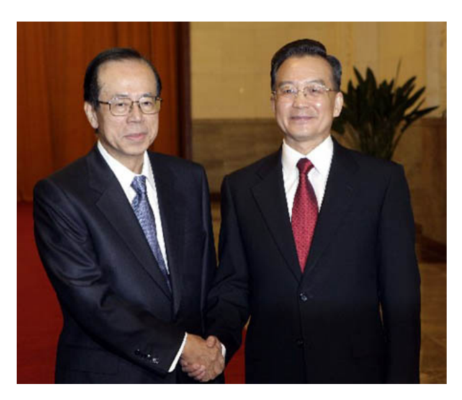
Chinese Premier Wen Jiabao shakes hands with the visiting Japanese Prime Minister Fukuda Yasuo in Beijing, December 28, 2007.

to overcome the political schism that plagued Koizumi Junichiro's five years as Prime Minister.