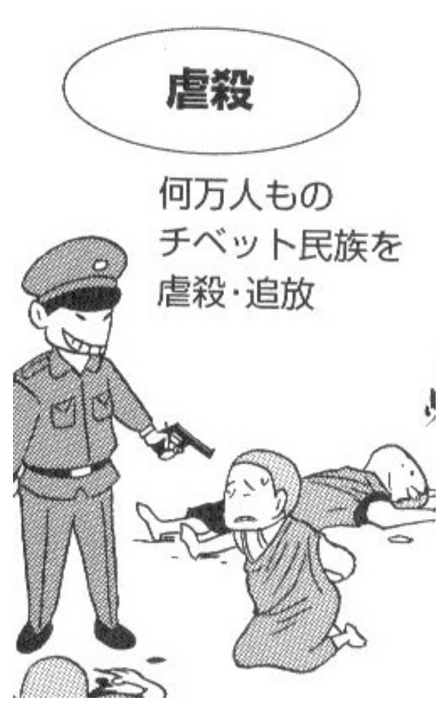
A demonizing image from Manga de wakaru.

Yet despite its excesses, many of the points it makes about pollution, human rights abuses, and other failings of the contemporary Chinese state are valid. The authors show concern for the oppressed, especially Tibetans and China's rural poor. In this, it differs from Manga Chugoku nyumon, which offered cultural attack in place of detailed discussion of issues.