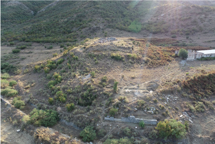
Fig. 7.6. The Hellenistic lower site and the upper and residential complex at Dobra.