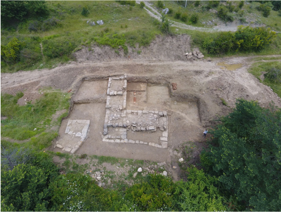
Fig. 7.1. Bushat, aerial photo of the city gate protected by a tower.

The mortuary landscape similarly worked to integrate hillfort communities rather than separate them.