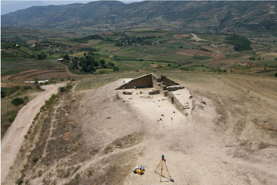
Fig. 7.3. The excavated tumulus at Lofkënd.

mosaic floors and inscriptions. In the later sixth century, the settlement was abandoned (Muçaj et al. 2019).