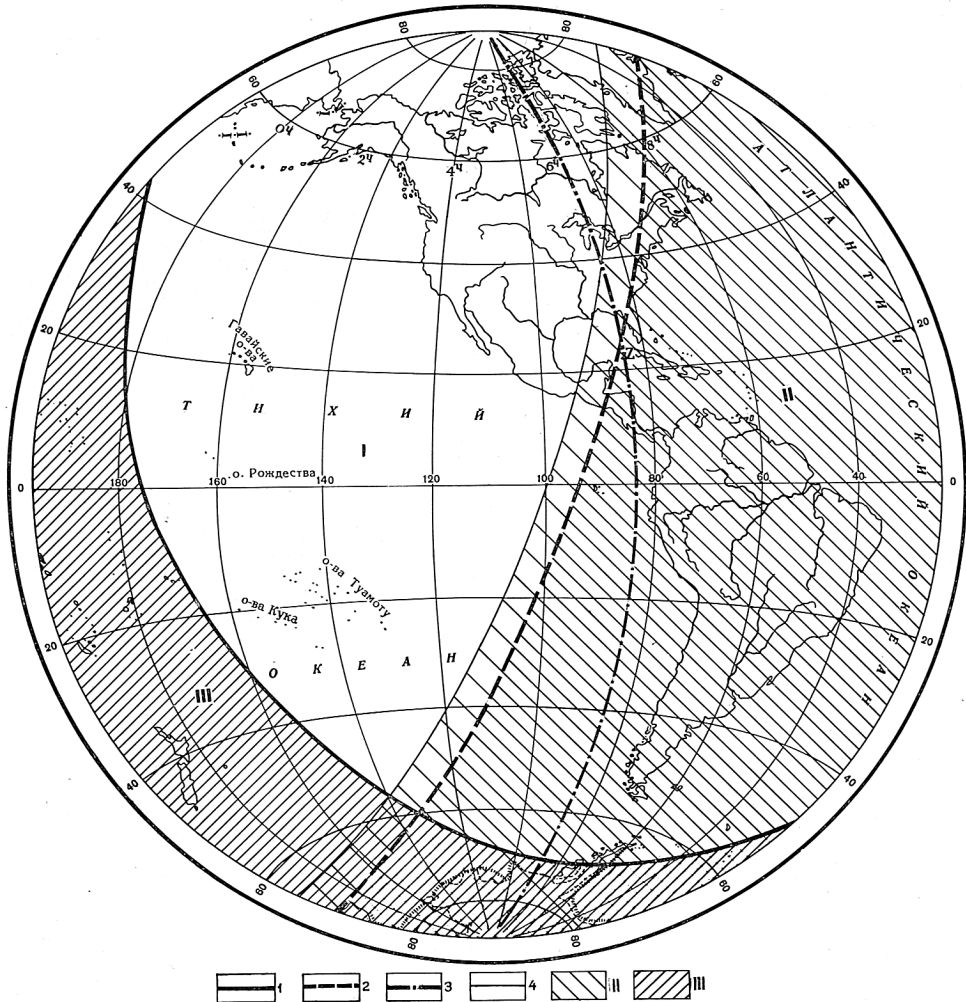
FIG. 1. Map of the Western hemisphere of the Earth, showing the observational conditions of the 1966 Leonid meteor shower: 1 – radiant on the horizon, 2 – the Sun on the horizon, 3 – radiant in culmination, 4 – the Sun at 6° below the horizon, I, II, III – see the text, Z – radiant in zenith.

(a) The moment of maximum was at November 17, 12 h 05 m ± 10 m UT.