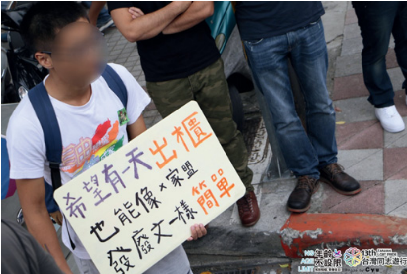
Figure 33 Taiwan LGBT+ Pride 2015.

As shown in Figure 33, humor is utilized as a means to criticize organizations (or individuals) in Taiwan who are unfriendly toward the LGBTQIA+ community. Specifically, the Family Guardian Coalition (Hùjiāméng), which is composed of various religious groups that oppose same-sex marriage legislation, is mocked in a humorous manner. While an “x” is perhaps used to protect the confidentiality of the Family Guardian Coalition, the LGBTQIA+ community in Taiwan is aware of the targeted group. The substitution of “x” for “hù” in order to maintain confidentiality (i.e., x-jiāméng ) may serve to strengthen in-group solidarity, as this practice assumes that all members of the Taiwanese