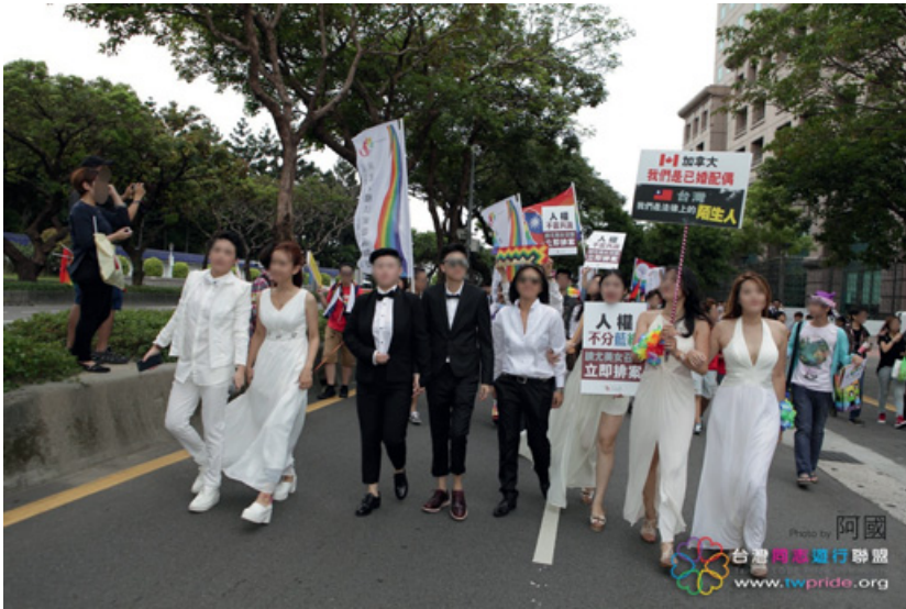
Figure 12 Taiwan LGBTQIA+ Pride 2014.

men's suit in the nineteenth century, Alfredsson and Augustsson (2017) point out that the so-called men's suit emerged in the late nineteenth and early twentieth centuries. It was characterized by three pieces: an ensemble of a jacket, waistcoat, and pants made in the same or similar fabric for mass production. The three-piece ensemble can also be observed in modern suits and tuxedos worn by men. Conversely, women's attire was crafted in a more elaborate style due to their comparatively lower societal influence relative to men's in the nineteenth century. The opulence observed in women's attire during the nineteenth century is also reflected in the gowns worn by women in contemporary societies. In light of the above, it can be posited that the two types of femininity depicted in Figure 12 exemplify the traditional gender binary of male and female.