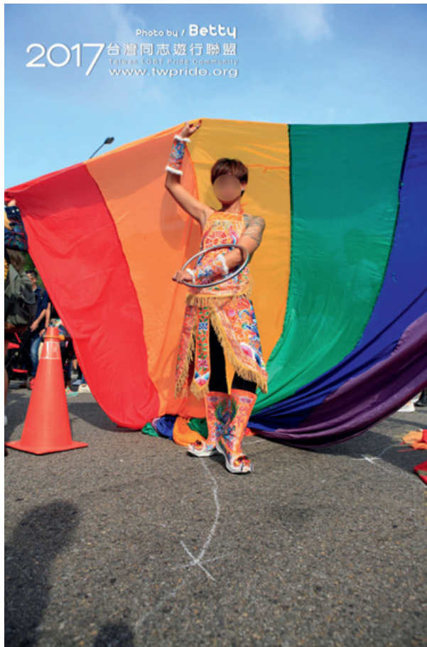
Figure 29 Taiwan LGBT+ Pride 2017.

show the Pride marchers' support for the pro-democracy protests in Hong Kong. This Western-style homonationalism was used by the Pride marchers to differentiate themselves from LGBTQIA+ Chinese in order to reify the local value of Taiwan, as exemplified in Taiwan's " tongzhi sovereignty," which according to Chen-Dedman (2023) links the legal rights and sexual citizenship of Taiwanese tongzhi (LGBTQIA+ Taiwanese) to the protection of Taiwan's political sovereignty, in response to the "China factor" in Taiwanese society. With respect to the current political climate across the Chinese regions, the contrast with the forms of homonationalism discussed in Ben's research on the Hong Kong Gay Games in Section 5 should be noted here.