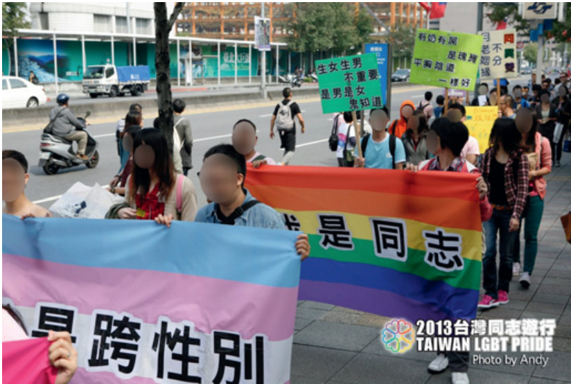
Figure 18 Taiwan LGBT+ Pride 2013.