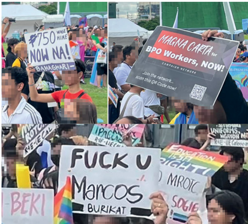
Figure 8 Signs that present socioeconomic calls.

The first image in Figure 8 (top-left) conveys a demand for a higher minimum wage. The sign presents an imperative in Taglish (i.e., English