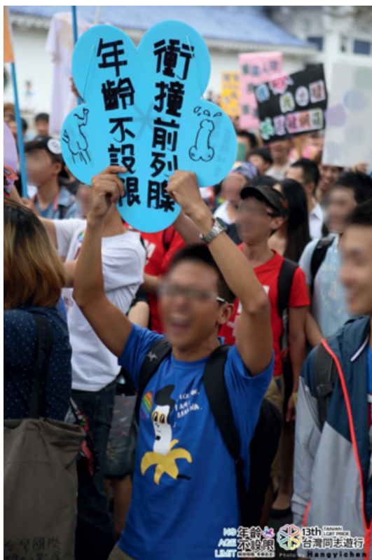
Figure 15 Taiwan LGBT+ Pride 2015.