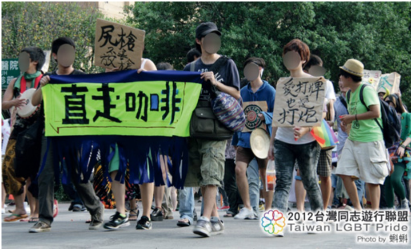
Figure 13 Taiwan LGBT+ Pride 2012.