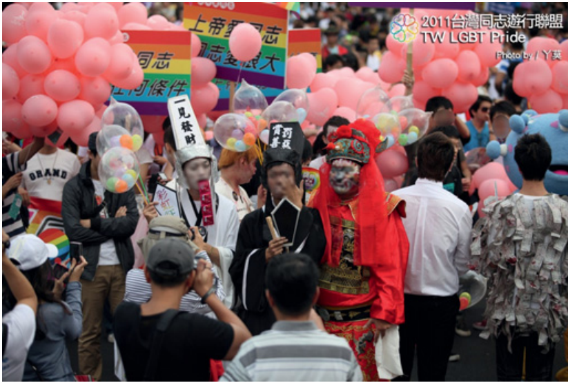
Figure 28 Taiwan LGBT+ Pride 2011.

Kui, traditionally known as the vanquisher of ghosts and evil beings. Although the three figures are from China, they are worshiped in temples and shrines in Taiwan and have become local gods. In Figure 29 , the marcher was also dressed as Prince Nezha, a protective deity in Chinese folk religion who is also known as the Marshal of the Central Altar or as the Third Prince in Taiwan. Interestingly, the marcher's costume and the rainbow flag interact to signal the harmony between Taiwanese localism and global queerness. Although the Pride marchers were dressed as figures from Chinese folk religion, their costumes show that Taiwan is a melting pot of cultures. More specifically, Taiwan's diversity, as reflected in its multilingual, multiethnic, and multicultural environment, is how tai-ness is embodied.