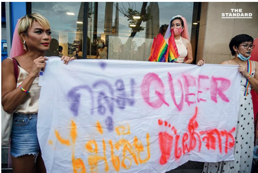
Figure 3 “We queer don’t lick dictatorship’s boots” (Hawae, 2020).

The underlying opposition between democracy and dictatorship was evident. LGBTQIA+ communities were portrayed as standing in opposition to the “dictatorship,” referring to the ruling government led by the prime minister, who had originally come to power through a coup in 2014. The message on the sign in Figure 3, which reads klum queer mai lia phadetkan “We queer don’t lick