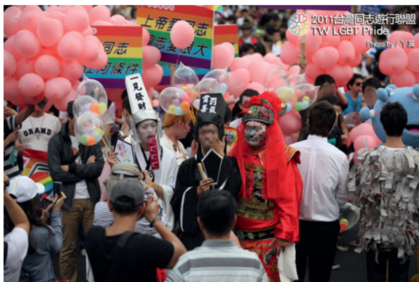
Figure 28 Taiwan LGBT+ Pride 2011.

Kui, traditionally known as the vanquisher of ghosts and evil beings. Although the three figures are from China, they are worshiped in temples and shrines in Taiwan and have become local gods. In Figure 29, the marcher was also dressed as Prince Nezha, a protective deity in Chinese folk religion who is also known as the Marshal of the Central Altar or as the Third Prince in Taiwan. Interestingly, the marcher's costume and the rainbow flag interact to signal the harmony between Taiwanese localism and global queerness. Although the Pride marchers were dressed as figures from Chinese folk religion, their costumes show that Taiwan is a melting pot of cultures. More specifically, Taiwan's diversity, as reflected in its multilingual, multiethnic, and multicultural environment, is how tai -ness is embodied.