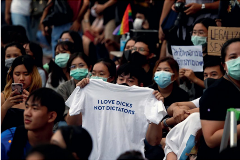
Figure 4 “I love dicks, not dictators” (Chuirpracha, 2020).

dictatorship’s boots,” clearly indicates that the queer community positioned itself on the opposing side to the “dictatorship.” Similarly, the message “I love dicks, not dictators” on the T-shirt in Figure 4 shows the rejection of the “dictatorship.” The message cleverly plays with the shared pronunciation of the word “dicks” and the first syllable of the word “dictators.” Given that the T-shirt is held by an individual who is perceived as male, the message can be interpreted as representative of male homosexual individuals. Furthermore, the message presented in Figure 1 earlier also highlights this opposition, as the kathoey identity is juxtaposed against “Tu,” which was intended to reference the prime minister at that time. These examples showcase the alignment of LGBTQIA+ communities with democracy.