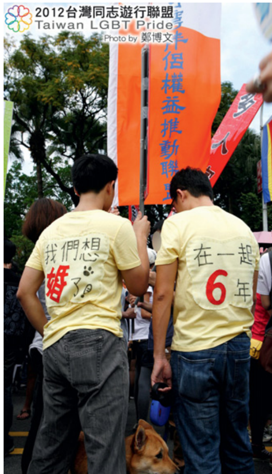
Figure 10 Taiwan LGBT+ Pride 2012.