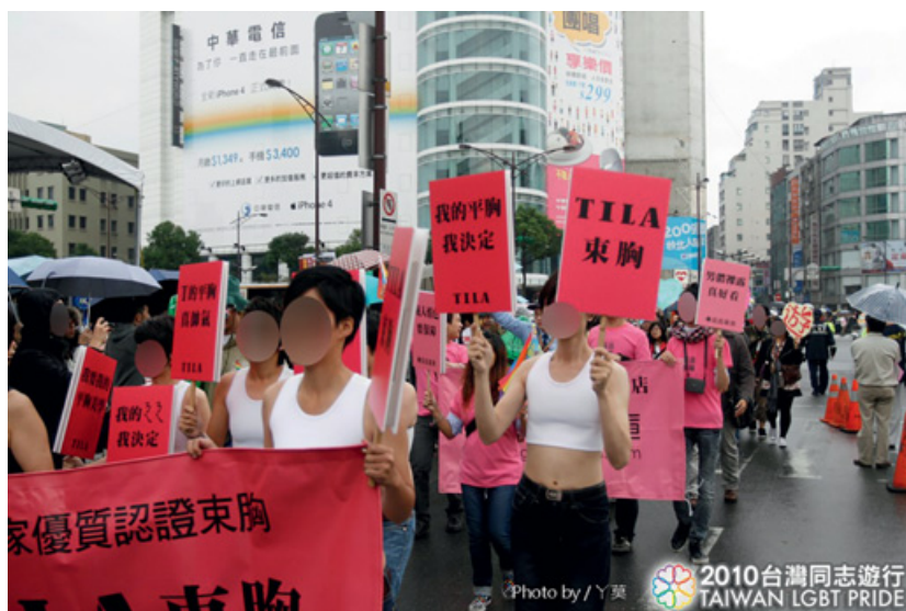
Figure 20 Taiwan LGBT+ Pride 2010.