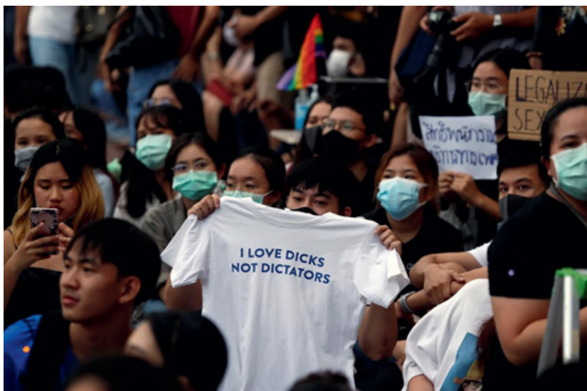
Figure 4 “I love dicks, not dictators” (Chuirpracha, 2020).

dictatorship’s boots,” clearly indicates that the queer community positioned itself on the opposing side to the “dictatorship.” Similarly, the message “I love dicks, not dictators” on the T-shirt in Figure 4 shows the rejection of the “dictatorship.” The message cleverly plays with the shared pronunciation of the word “dicks” and the first syllable of the word “dictators.” Given that the T-shirt is held by an individual who is perceived as male, the message can be interpreted as representative of male homosexual individuals. Furthermore, the message presented in Figure 1 earlier also highlights this opposition, as the kathoey identity is juxtaposed against “Tu,” which was intended to reference the prime minister at that time. These examples showcase the alignment of LGBTQIA+ communities with democracy.