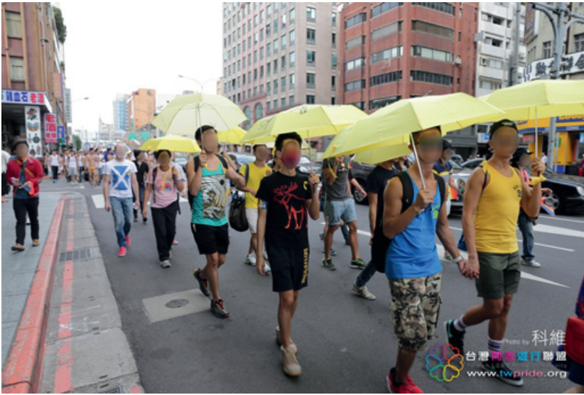
Figure 30 Taiwan LGBT+ Pride 2014.