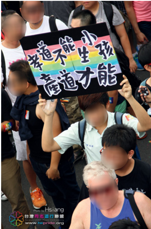
Figure 17 Taiwan LGBT+ Pride 2014.