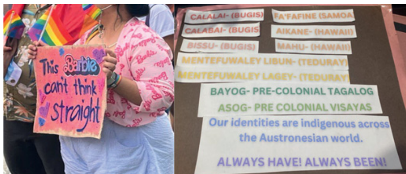
Figure 7 Signs that represent sexual identities.

identifications. One such instance is observed in the first sign (Figure 7, left), bearing the message “This Barbie can’t think straight.” This sign deploys intertextuality as a tool to convey its message, referencing the online promotional campaign associated with the Barbie movie franchise (i.e., the phrase “This Barbie . . .”) (Hodges, 2015). This intertextual linkage bridges the mainstream media with LGBTQIA+ representation, which aids in embedding LGBTQIA+ identities through recognizable forms of popular culture. Moreover, by invoking Barbie, a symbol of heteronormative feminine ideals and traditional gender roles and juxtaposing it with the evaluation “can’t think straight,” this sign disrupts the heterosexual expectations and assumptions. By adopting the name and typography of the Barbie logo, the sign aligns itself with dominant culture – specifically, a commodified notion of heterosexual femininity and womanhood – while simultaneously creating a paradox by acknowledging nonheterosexuality. This discursive move transforms the sign into a tool for disruption, celebrating the deviation from normative expectations.