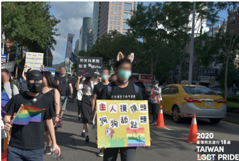
Figure 16 Taiwan LGBT+ Pride 2020.