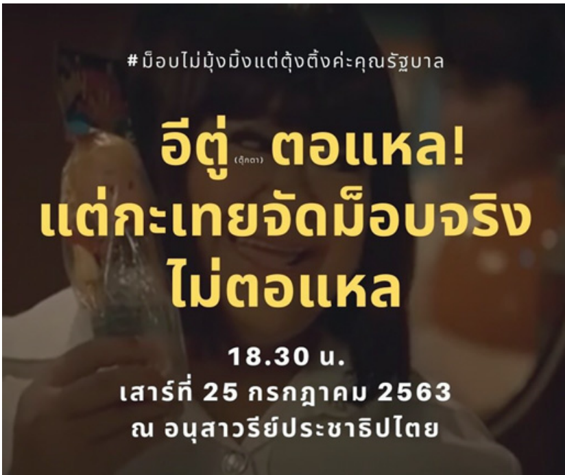
Figure 2 “Tu (the doll), you liar! But kathoey will really lead a protest, not liars here” (Raptor eng cha, 2020).