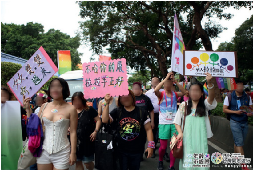
Figure 19 Taiwan LGBT+ Pride 2015.