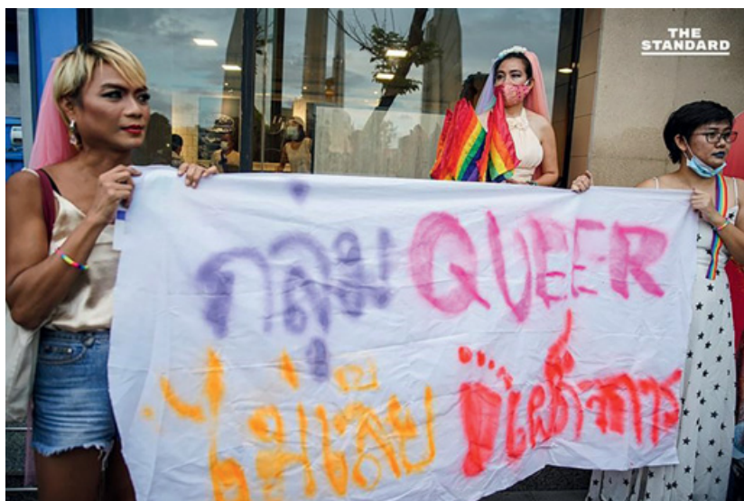
Figure 3 “We queer don’t lick dictatorship’s boots” (Hawae, 2020).

The underlying opposition between democracy and dictatorship was evident. LGBTQIA+ communities were portrayed as standing in opposition to the “dictatorship,” referring to the ruling government led by the prime minister, who had originally come to power through a coup in 2014. The message on the sign in Figure 3 , which reads klum queer mai lia phadetkan “We queer don’t lick