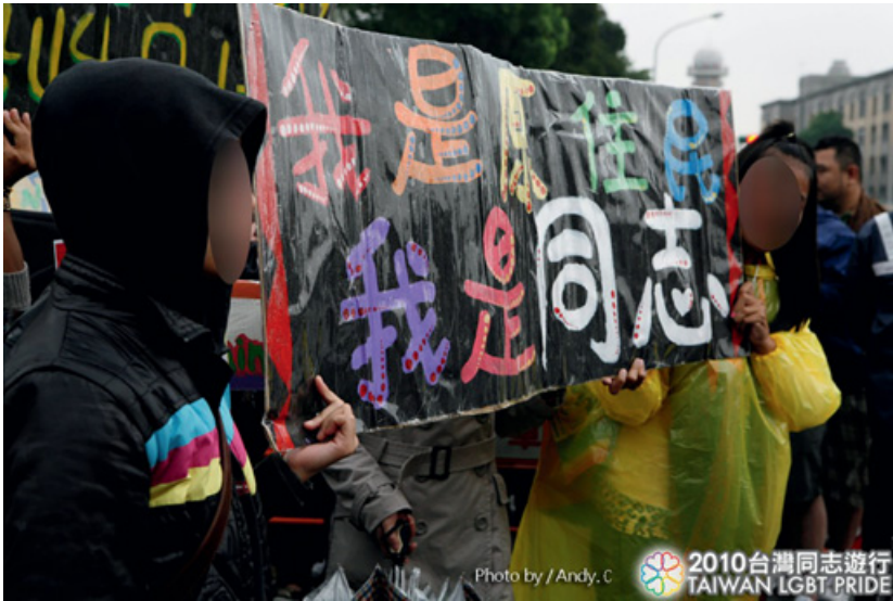
Figure 24 Taiwan LGBT+ Pride 2010.