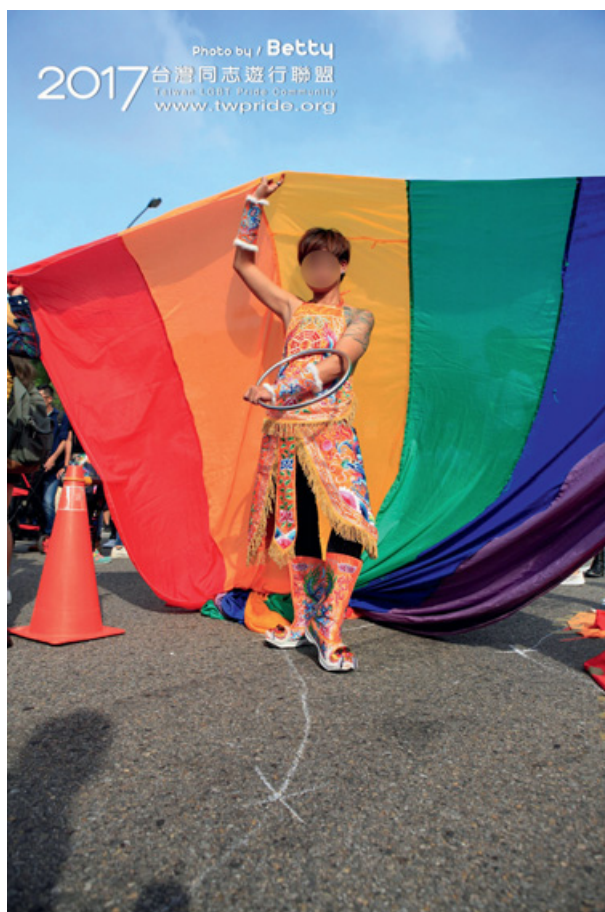
Figure 29 Taiwan LGBT+ Pride 2017.

show the Pride marchers' support for the pro-democracy protests in Hong Kong. This Western-style homonationalism was used by the Pride marchers to differentiate themselves from LGBTQIA+ Chinese in order to reify the local value of Taiwan, as exemplified in Taiwan's " tongzhi sovereignty," which according to Chen-Dedman (2023) links the legal rights and sexual citizenship of Taiwanese tongzhi (LGBTQIA+ Taiwanese) to the protection of Taiwan's political sovereignty, in response to the "China factor" in Taiwanese society. With respect to the current political climate across the Chinese regions, the contrast with the forms of homonationalism discussed in Ben's research on the Hong Kong Gay Games in Section 5 should be noted here.