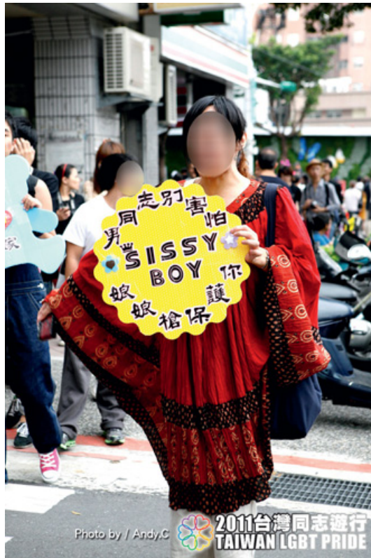
Figure 22 Taiwan LGBT+ Pride 2011.

Figure 22 shows this new form of masculinity, i.e., feminine masculinity, as evidenced by the derogatory term, niángniángqiāng “sissy boy; sissy-gun” and the verb, bǎohù “to protect.” While 娘娘槍 niángniáng-qiāng “sissy-gun” is the play