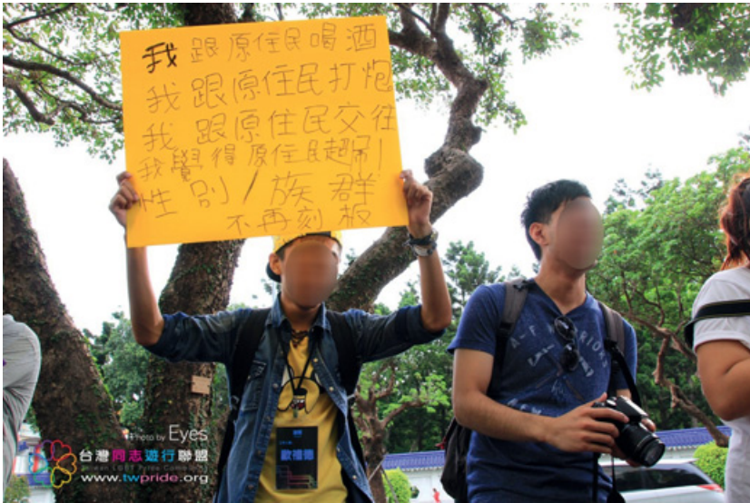
Figure 25 Taiwan LGBT+ Pride 2014.