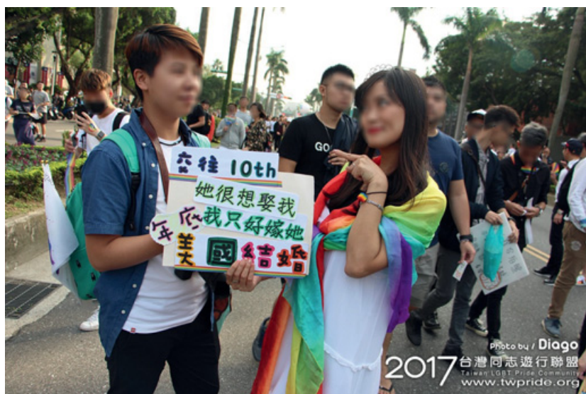
Figure 11 Taiwan LGBT+ Pride 2017.