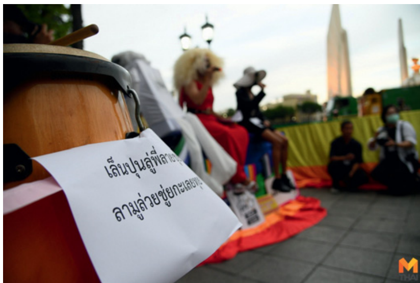
Figure 5 “I am a man who comes to assist kathoey ” (Mono News, 2020).

identified as men. This highlights the usage of another linguistic tool associated with the kathoey identity. It emphasizes the prevalence of kathoeyness and showcases the involvement of a non-LGBTQIA+ identity playing a supporting role within the LGBTQIA+-led movement.