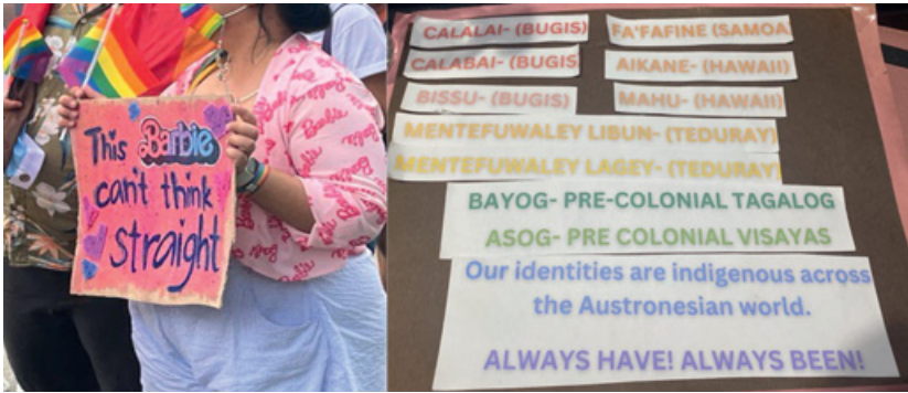
Figure 7 Signs that represent sexual identities.

identifications. One such instance is observed in the first sign (Figure 7, left), bearing the message “This Barbie can’t think straight.” This sign deploys intertextuality as a tool to convey its message, referencing the online promotional campaign associated with the Barbie movie franchise (i.e., the phrase “This Barbie . . .”) (Hodges, 2015). This intertextual linkage bridges the mainstream media with LGBTQIA+ representation, which aids in embedding LGBTQIA+ identities through recognizable forms of popular culture. Moreover, by invoking Barbie, a symbol of heteronormative feminine ideals and traditional gender roles and juxtaposing it with the evaluation “can’t think straight,” this sign disrupts the heterosexual expectations and assumptions. By adopting the name and typography of the Barbie logo, the sign aligns itself with dominant culture – specifically, a commodified notion of heterosexual femininity and womanhood – while simultaneously creating a paradox by acknowledging nonheterosexuality. This discursive move transforms the sign into a tool for disruption, celebrating the deviation from normative expectations.