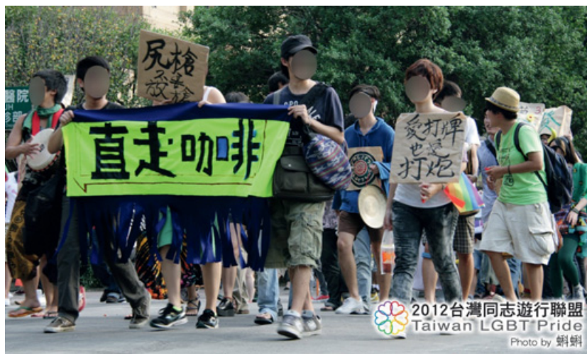
Figure 13 Taiwan LGBT+ Pride 2012.