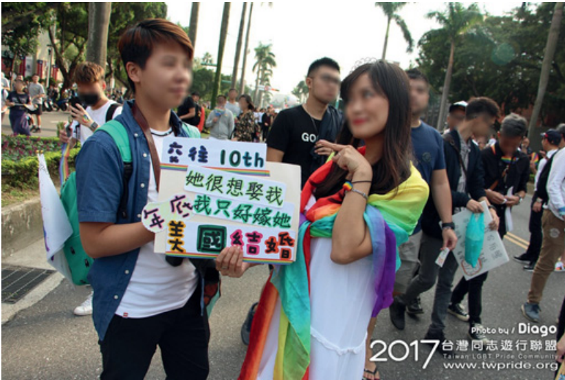
Figure 11 Taiwan LGBT+ Pride 2017.