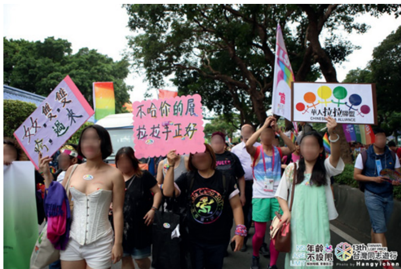
Figure 19 Taiwan LGBT+ Pride 2015.