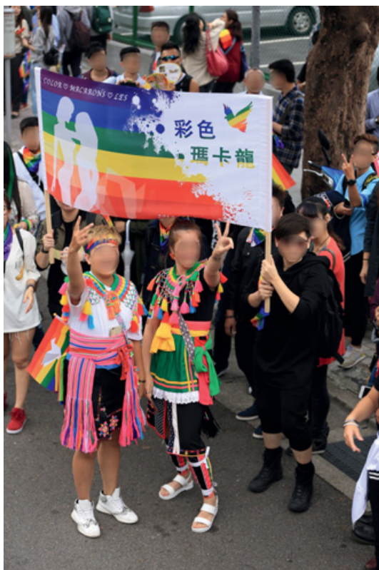
Figure 26 Taiwan LGBT+ Pride 2015.

The tai -ness can be seen through humorous expressions of confrontational politics. In Figure 27 , the humor of the slogans relies heavily on visual modalities. As we can see, the slogans are presented as Taoist paper talismans – strips of yellow paper on which words written in cinnabar have the power to drive away demons. In line 1, moreover, the Ministry of Justice, the Registered Partnership Act, and legislation based on discrimination are demonized. Because in 2016 the existing Taiwan Civil Code only recognized heterosexual marriage, there was debate about whether the new bill would only legalize same-sex civil partnerships, not marriage, and not opposite-sex civil partnerships, which is discriminatory. While the slogans, presented as Taoist paper talismans, may evoke a hearty laugh and a knowing smile among the in-group members of the Taiwanese society (Chen, 2017), they are not intended for outsiders.