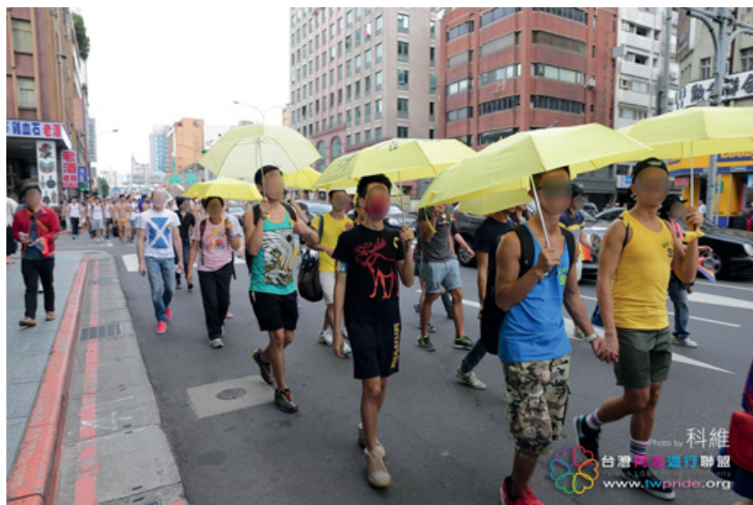
Figure 30 Taiwan LGBT+ Pride 2014.