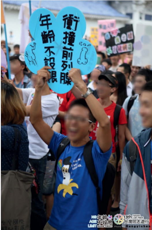
Figure 15 Taiwan LGBT+ Pride 2015.