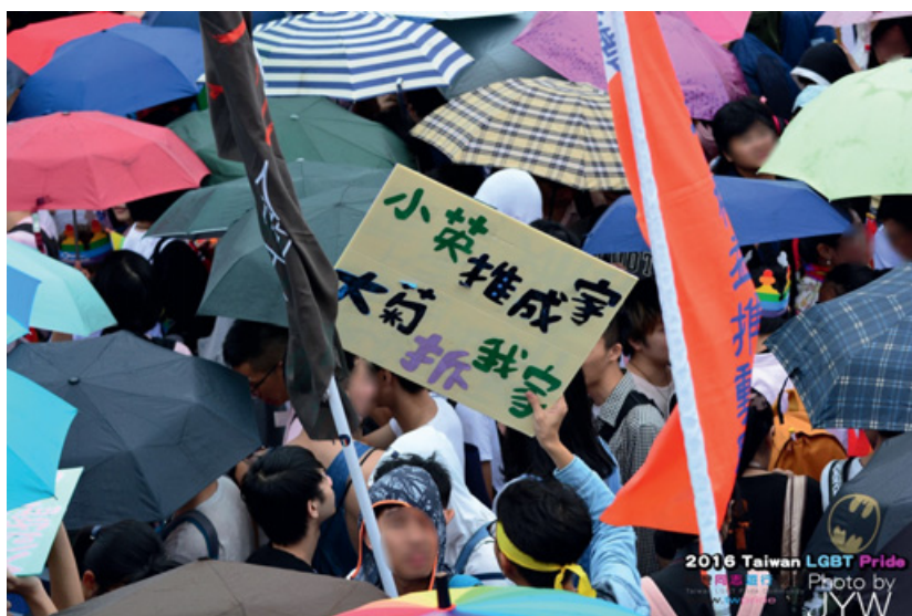
Figure 32 Taiwan LGBT+ Pride 2016.