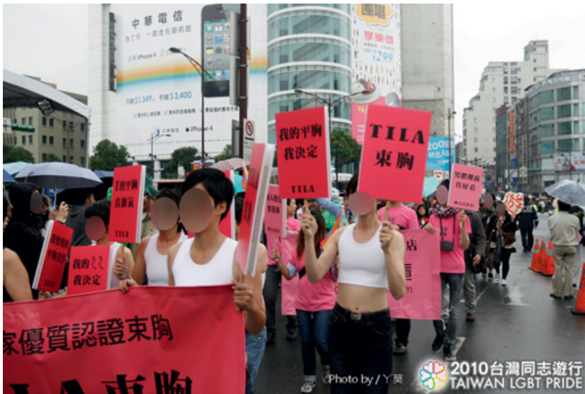
Figure 20 Taiwan LGBT+ Pride 2010.