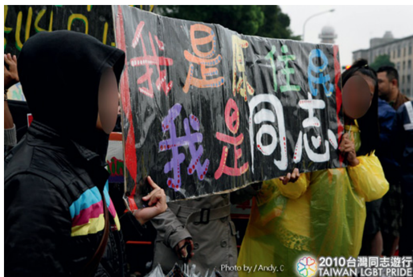
Figure 24 Taiwan LGBT+ Pride 2010.