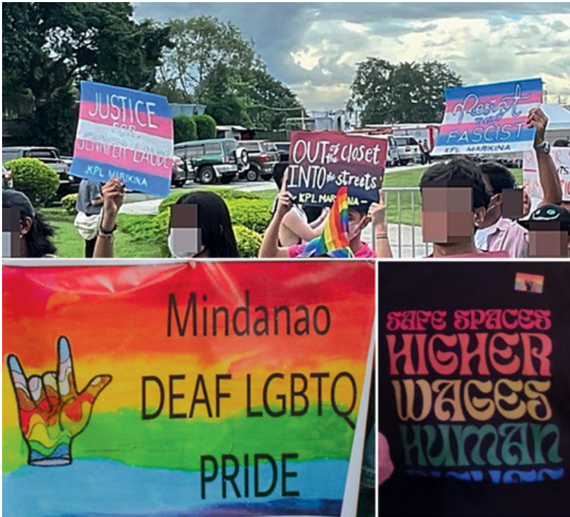
Figure 9 Signs that present intersectional calls.

the local LGBTQIA+ community. It explicitly asserts a dual identity: being both “Mindanaoan” and part of the LGBTQIA+ community. By doing so, the sign challenges the dominant narrative of LGBTQIA+ experiences centered in urban areas, giving visibility to regional identities. Moreover, the inclusion of “Deaf” expands the representation of marginalized groups within the LGBTQIA+ community. The third image (Figure 9, bottom-right) depicts a shirt displaying the text “safe spaces. higher wages. human rights,” utilizing rainbow colors and varying font sizes. This clothing item presupposes the interconnectedness of numerous forms of oppression that impact different marginalized groups, thereby constituting an intersectional call. Firstly, the message incorporates key phrases frequently found in LGBTQIA+ activism, such as “safe space” and “human rights,” which are combined with a demand for higher wages. The presence of these phrases, coupled with the use of rainbow colors, contributes to a multimodal alignment that indexes LGBTQIA+ individuals who face socio-economic disadvantage. Notably, the varied text sizes establish visual hierarchies that potentially suggest the prioritization of material needs and rights over safe spaces, introducing a layer of ambiguity. In interweaving these diverse