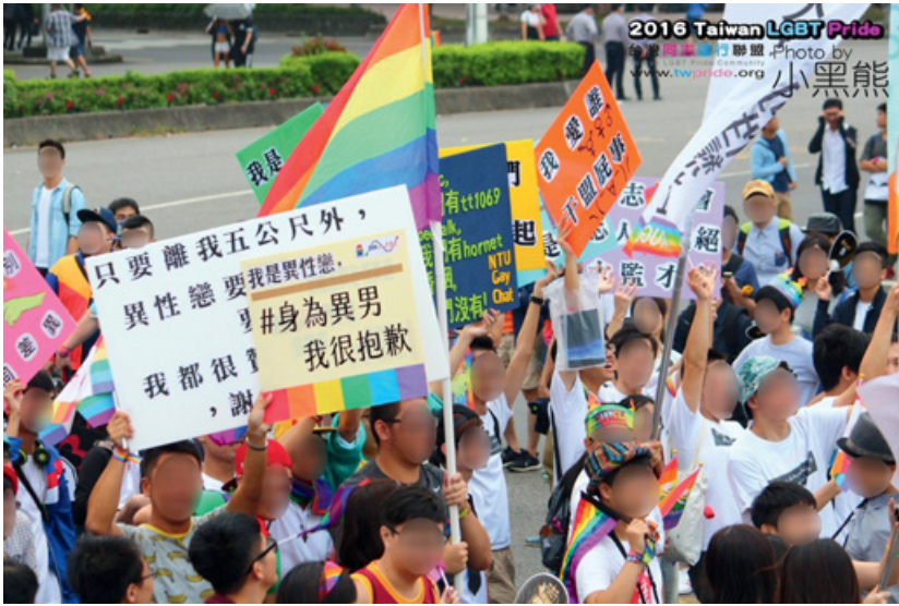
Figure 23 Taiwan LGBTQIA+ Pride 2016.