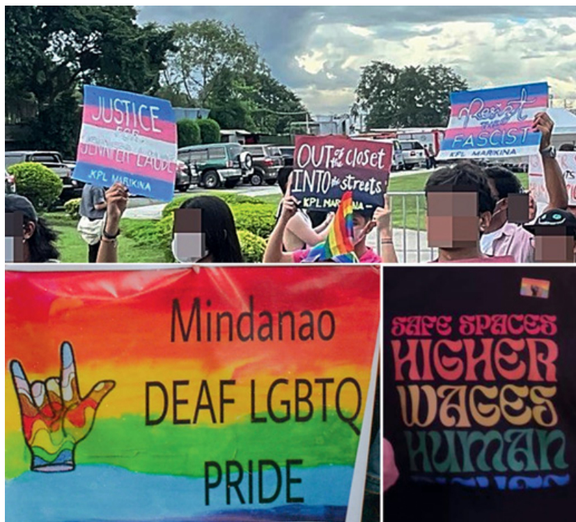
Figure 9 Signs that present intersectional calls.

the local LGBTQIA+ community. It explicitly asserts a dual identity: being both “Mindanaoan” and part of the LGBTQIA+ community. By doing so, the sign challenges the dominant narrative of LGBTQIA+ experiences centered in urban areas, giving visibility to regional identities. Moreover, the inclusion of “Deaf” expands the representation of marginalized groups within the LGBTQIA+ community. The third image (Figure 9, bottom-right) depicts a shirt displaying the text “safe spaces. higher wages. human rights,” utilizing rainbow colors and varying font sizes. This clothing item presupposes the interconnectedness of numerous forms of oppression that impact different marginalized groups, thereby constituting an intersectional call. Firstly, the message incorporates key phrases frequently found in LGBTQIA+ activism, such as “safe space” and “human rights,” which are combined with a demand for higher wages. The presence of these phrases, coupled with the use of rainbow colors, contributes to a multimodal alignment that indexes LGBTQIA+ individuals who face socio-economic disadvantage. Notably, the varied text sizes establish visual hierarchies that potentially suggest the prioritization of material needs and rights over safe spaces, introducing a layer of ambiguity. In interweaving these diverse