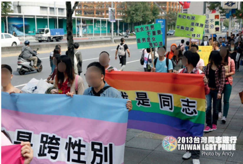
Figure 18 Taiwan LGBT+ Pride 2013.