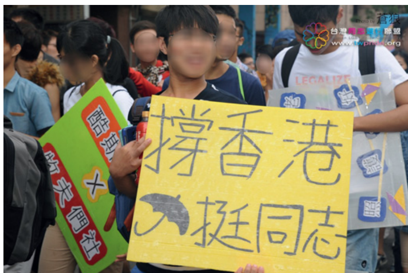
Figure 31 Taiwan LGBT+ Pride 2014.