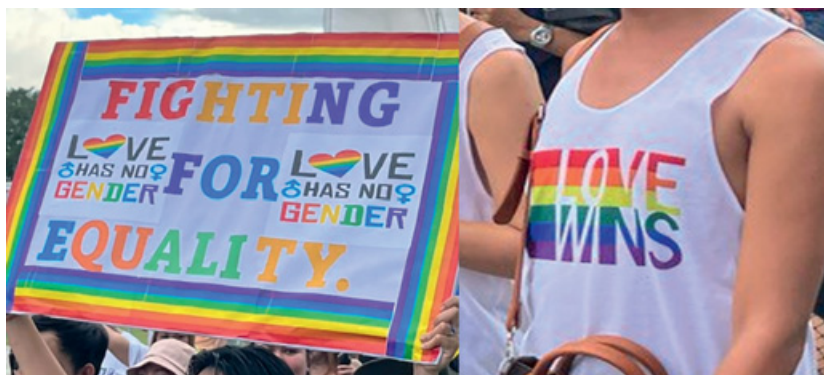
Figure 6 Signs that represent global LGBTQIA+ discourses.

reflect local engagement with global LGBTQIA+ discourses of visibility, tolerance, and diversity.