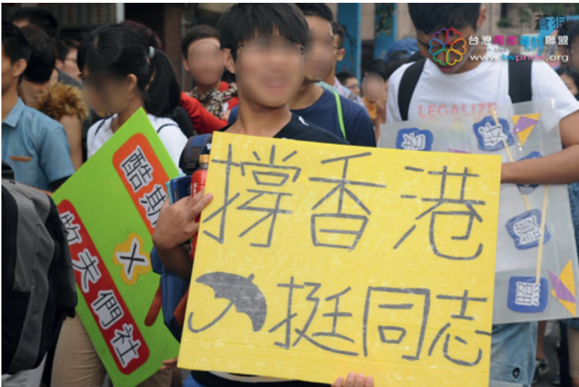
Figure 31 Taiwan LGBT+ Pride 2014.