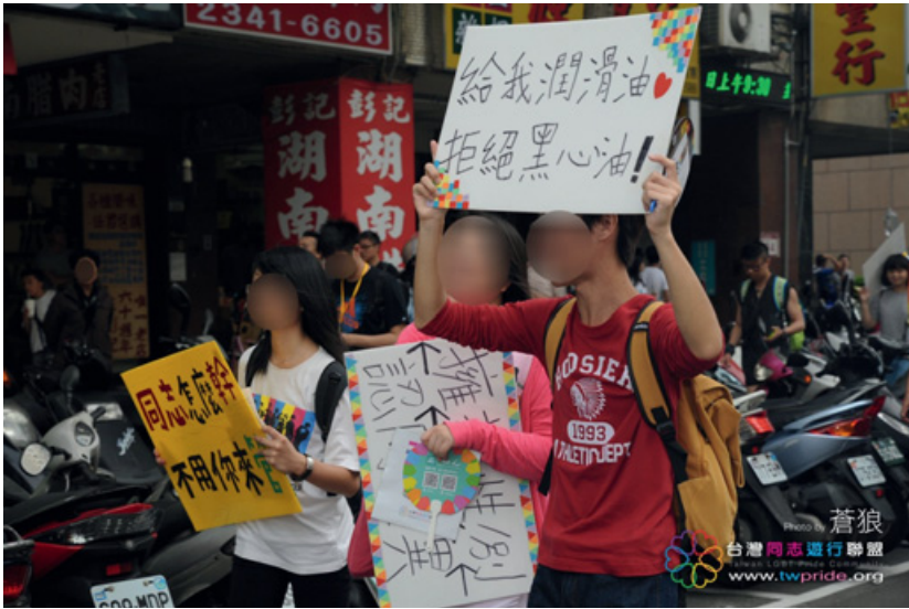
Figure 14 Taiwan LGBT+ Pride 2014.