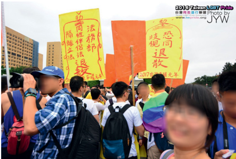
Figure 27 Taiwan LGBT+ Pride 2016.