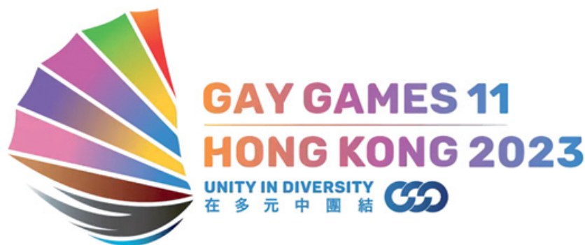
Figure 34 Gay Games 11 logo.

The logo for the Hong Kong Games (Figure 34) depicts a Chinese sampan , a type of traditional sailing vessel associated with the iconic Victoria Harbour, its customary red sail replaced in this design by a rainbow sail, the symbol of the LGBTQIA+ movement. In this way, the logo functions semiotically to represent the crossing of the Gay Games brand into new spaces, as it travels from West to East.