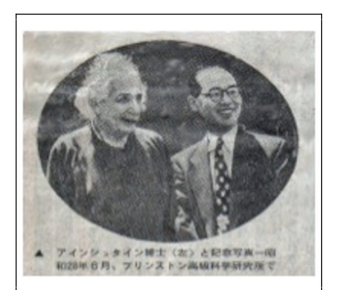
Yukawa Hideki with Einstein at Princeton, 1953

In the material that Dr Sakata left behind, I discovered he had come up with many new proposals which, even in their original form, would be applicable to the present day, such as one outlining the need for a safety regulatory committee to give top priority to safety, independent of pro-nuclear power government agencies.