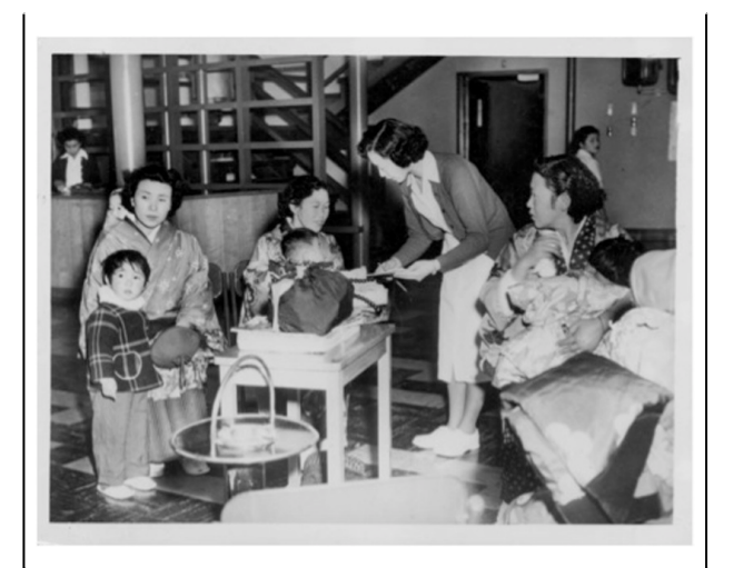
ABCC screening of atomic victims

The ABCC research focused on external exposure from radiation released during the first minute after the atomic blast. Radiation released after the first minute of the blast is known as residual radiation. Residual radiation includes radiation released from matter that has undergone neutron activation through the absorption of neutrons from initial radiation, and radiation released from radioactive fallout. At the time there was much debate over the destructive power of initial radiation from a nuclear weapon. So the fact that the ABCC was keen to focus primarily on initial radiation and reluctant to examine the longer-term effects of residual radiation indicates that the driving force behind the ABCC study was to better understand nuclear war, not the science of radiation.