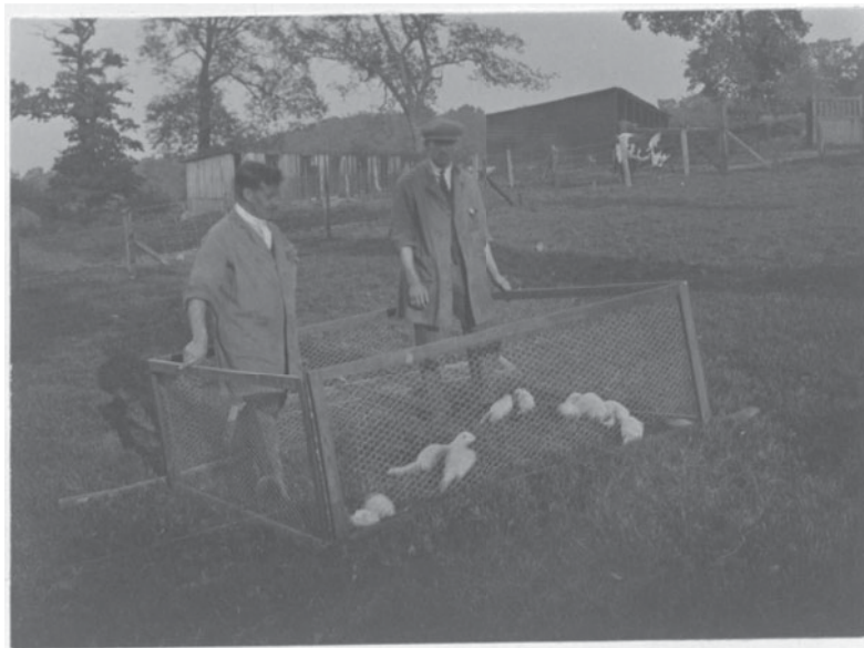
Figure 6. Purpose-bred ferrets at Mill Hill. Date unknown (c.1924–1926).

Italy, France and Germany, but without purpose-bred animals. Laidlaw and Dunkin reviewed and largely dismissed this early work. 79 Although they were confident they now had the ‘right’ pathogen, along with the facilities and techniques for its manipulation, they found, as others had before them, that producing virus vaccines was difficult. 80 The key obstacle was the lack of artificial culture media and techniques with which to purify the pathogen. The problem was repeatedly highlighted in MRC and DRC reports, and in the medical press. 81 Virus vaccines had to be produced and standardized at the whole-animal or tissue level, as in the well-established vaccines used for smallpox and rabies. 82 In the 1920s, researchers searched for improved methods for