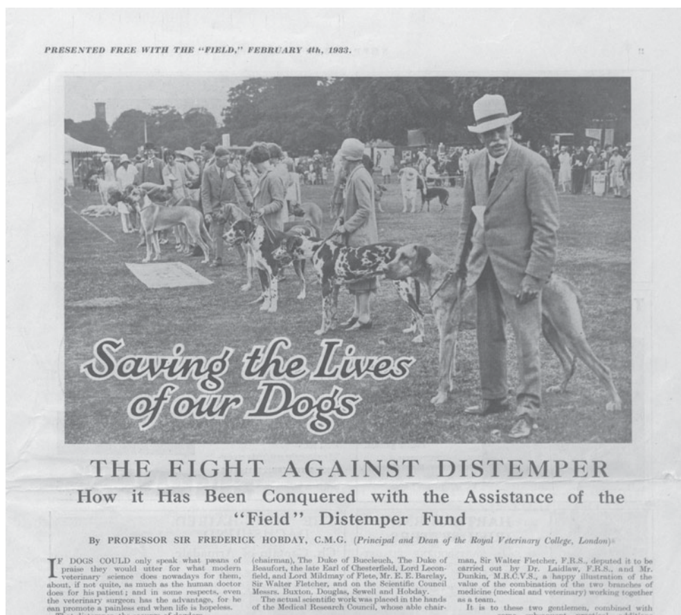
Figure 1. The cover of the special issue of The Field celebrating the introduction of dog distemper vaccines. ‘Saving the lives of our dogs’, The Field , 4 February 1933, p. 1.