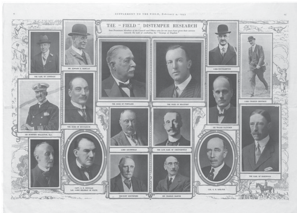
Figure 4. The Field Distemper Research Council, The Field , 4 February 1933, p. 9.

being an avid hunter and outdoorsman who maintained a country home and close relations with the landed gentry. 53 Bringing together representatives from both animal and human pathology, the DRC aimed to establish 'a constant and invaluable interchange of ideas and methods'.