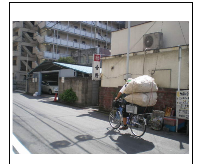
A good haul of cans

instance, or to muscle in on a garbage spot already being foraged by another man.