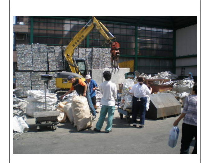
Nakajima Kinzoku, a Kawasaki scrap metal dealer, had the air of a gold-rush town in 2007

it an offense for anyone other than municipal garbage-collectors to remove the contents. What was once viewed as trash is now widely seen as a valuable resource. Kawasaki's mighty neighbor, Yokohama, has passed such an ordinance.<sup>8</sup>