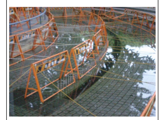
Anti-homeless barriers in Wakamiya Park