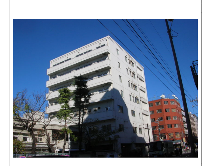
Hamakaze municipal homeless shelter, Kotobuki-chō, Yokohama

Here is a micro-level example of the regional variation in thinking on self-reliance. Tokyo's Ōta-ryō shelter gives each man a packet of twenty Mild Seven cigarettes a day. Staff explained to me that most of the men using the shelter were smokers, and if they were not given cigarettes, they would have to go around the streets looking for dog-ends, which would damage their self-respect. Mild Seven cost 300 yen a pack and are one of the principal mainstream brands smoked by salarymen. The Hamakaze shelter in Yokohama gives each man ten Wakaba cigarettes a day.