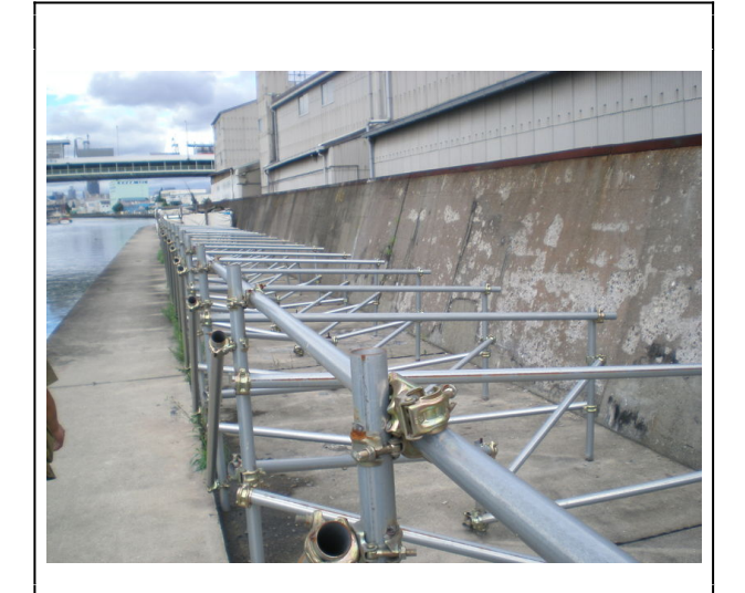
Scaffolding designed to prevent shack construction on the Kizu River, Osaka

threatening any who refuse to go with forcible expulsion, as in Hotoke's case, and fencing off vacated areas of parks to prevent newcomers or returnees from settling there (see pics 7 and 8 above, pic. 20 below). By such methods have the authorities gradually whittled down the park populations. The elaborate homemade dwellings celebrated by Sogi, Sakaguchi and Nagashima are becoming steadily harder to find.