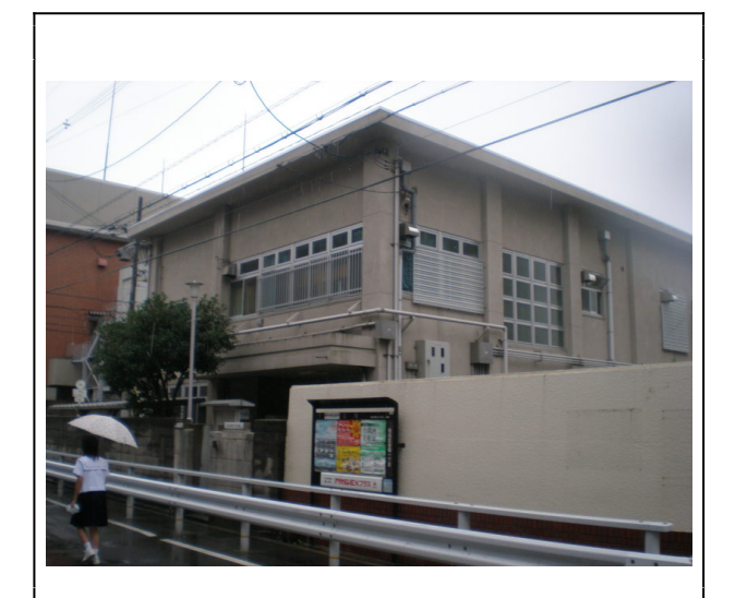
Nishinari Self-Reliance Support Center, Osaka

they are not to be spoiled by being given a whole pack of mainstream cigarettes such as people in regular employment smoke. The Nishinari Self-Reliance Support Center in Osaka gives its residents no cigarettes; instead the residents are made to work for 15 minutes every day, on cleaning and tidying the premises. Their wage for this labor is 300 yen—which they can feed into the cigarette vending machine in the lobby to buy a pack of twenty of their preferred brand. Here too, the importance of maintaining the men's self-respect is emphasized, though this time the threat is seen as coming from getting something for nothing, rather than from having to search for dog-ends.