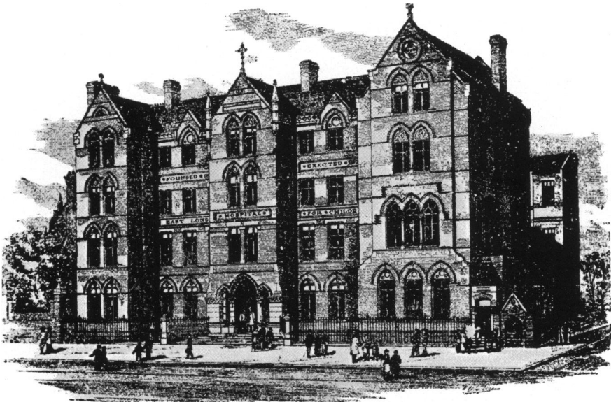
East London Hospital for Children about 1900