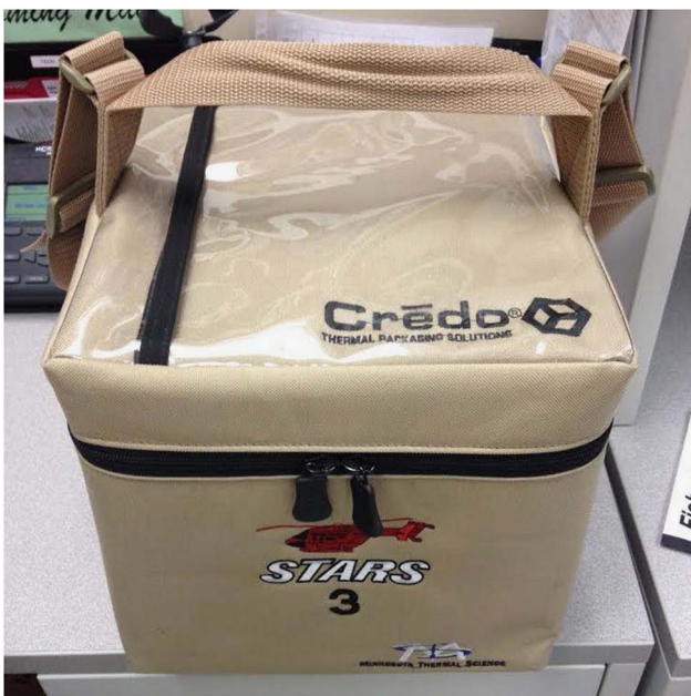
Figure 3. Each blood box is prepared and sealed by transfusion services personnel with two units of O negative pRBCs and the temperature logger inside.

Root causes of delayed blood bank notifications could generally be attributed to specific communication challenges arising during complex care of unstable patients. These included TPs otherwise engaged in patient care or crew communications, and unexpected