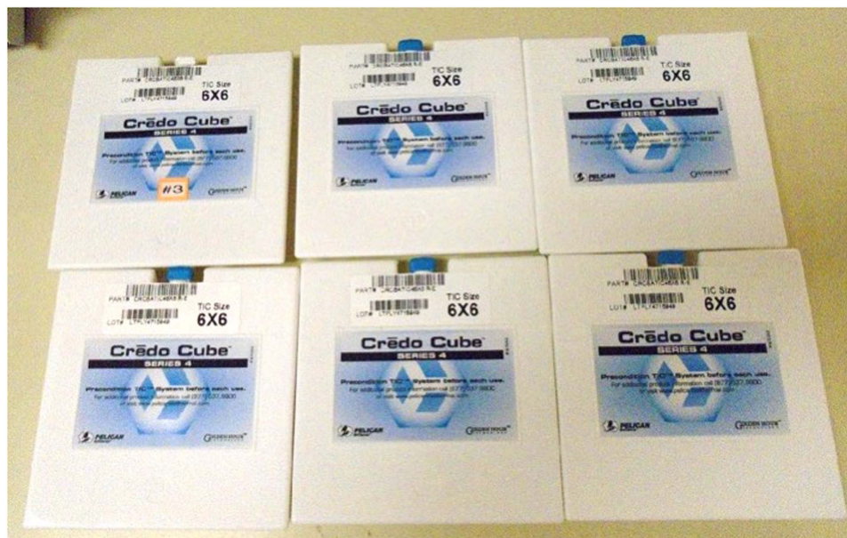
Figure 2. Phase-change panels are stored at -20^{\circ}\text{C} and conditioned at room temperature for 25 minutes prior to packing.

To monitor the internal temperature, each cooler contains a continuous electronic temperature recorder (LogTag Recorders TRID30-7, Westfield, New Jersey, USA). The device records time-stamped data for extraction and also provides a visual alert if the internal temperature has deviated from the required range. The coolers are monitored and maintained between 1^{\circ}\text{C} and 6^{\circ}\text{C} in accordance with the Western Canada Diagnostic Accreditation Alliance, Canadian Standards Association, and Canadian Society for Transfusion Medicine recommendations. 16