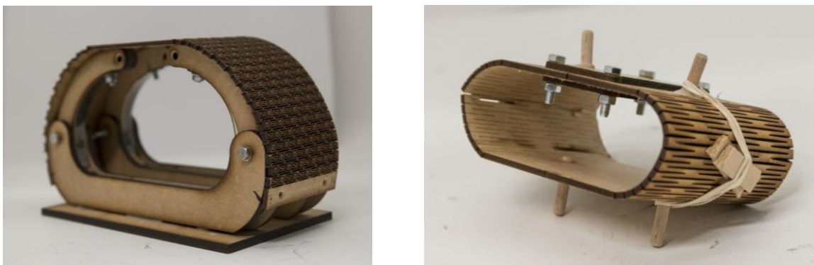
Figure 2. Prototypes built using living hinges

The project case illustrating this method of prototyping is the conceptual prototyping of a new chest for resuscitation mannequins. The project was challenged with generating new concept ideas for a training mannequin by mimicking the human chest. This required concepts to have similar shape and deformation as a chest would, which inspired the creation of multiple concepts whereas two can be seen in Figure 2. The designers used simple 2D drawings to run the laser cutting operation, which meant little time was spent in virtual prototyping environment. In addition, the speed of fabrication, made it possible for the design team to create multiple design alternatives, hence, adapt quickly to new insights. As seen in Figure 2, the design experimented with different cut patterns that enabled one or two degrees of freedom for the compression mechanism.