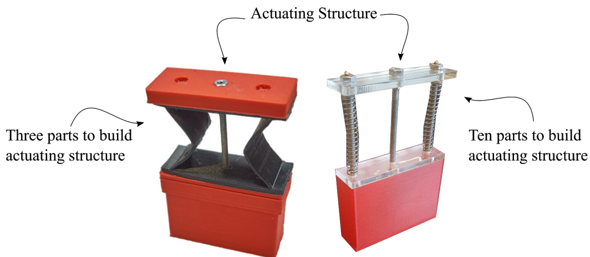
Figure 3. Prototypes built by using fused filament fabrication

The case illustrating this prototyping method, is the development of a spring mechanism for a personal drug mixing container. For this case example, there was a need to reduce mechanical complexity as part count and assembly made the concept prone to jamming and backlash. By drawing on the advantages of FFF with flexible materials it was possible to make a conceptual model, as seen in Figure 3. of high fidelity and resolution, fitting the assembly constraints.