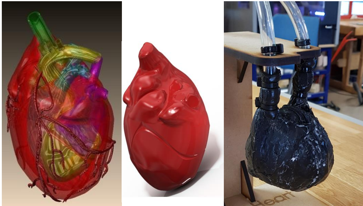
Figure 5. A human heart represented by a virtual prototype (left and centre) and a physical phantom (right) built using moulding with flexible materials

This method of prototyping is relatively slow, as it requires several sequential steps to produce a testable prototype. The production of the mould negatives with FFF (both in CAD and the fabrication itself) is time consuming, and when coupled with the silicone curing time, the per-prototype iteration time until physical testing can start is long. While this case is illustrating mould fabrication using FFF, other methods such as clay casting, manual sculpting and subtractive manufacturing might be more suitable in other cases. As mould fabrication is a means of prototyping moulds, it is in the context of this paper worth noting that efforts in prototyping the moulds affect both attributes of the flexible prototypes as well as activity performance in terms of time and ability to alter designs. One example is how the resolution and fidelity of moulded parts are governed by the surface finish and geometrical design freedom of the moulds, giving FFF advantages of being little constrained in terms of geometry, but subjected to rough surfaces as a result of fabrication technique.