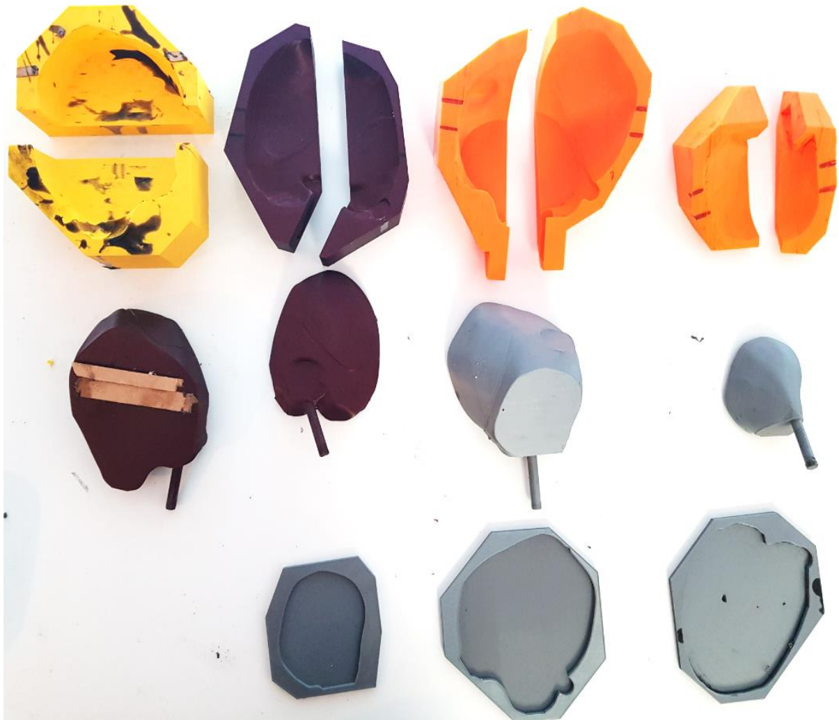
Figure 4. Mould negatives built using rigid materials that were used for moulding flexible phantom hearts with flexible material

The case example used to demonstrate this prototyping method, a challenge of fabricating and testing a phantom heart in a composite silicone material is considered. This phantom heart was to be used for research on heart flow and ultrasound imaging. To create this phantom, a contrast material was added the silicone to make the part visible on the ultrasonic imaging equipment. For the phantom to achieve flow conditions as found in real heart, the physical model had to replicate key anatomical features of a human heart. High resolution and fidelity were hereby needed to fulfil flow conditions, shape resemblance, and deformation resemblance to a real heart. An additional point to make is that the phantom needed to withstand the internal pressure present as the closed liquid system where to be displayed in air rather than dispersed in liquid. In this case, the heart was first prototyped virtually to create the mould negatives using fused filament fabrication, as shown in Figure 4, and was then moulded using silicone, as shown in Figure 5.