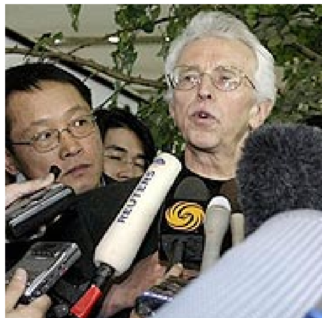
Hecker briefing the press following the visit

The Hecker visit confirmed that, despite media reports, Pyongyang had submitted its declaration, but there remained three issues of contention between the two sides – the amount of plutonium the Koreans had extracted from the Yongbyon reactor, the question of nuclear cooperation with Syria, and enriched uranium. The declaration has not been made public and Hecker's report is the best thing we have in the public domain on the issues, although he is, of course, coming at it from an American perspective. [17] He has no doubts that the US has a god-given right to nuclear weapons but that this indulgence does not extend to North Koreans.