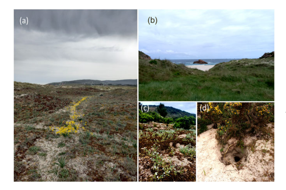
PLATE 1 (a) An example of the preference of Iberodes littoralis subsp. gallaecica for footpaths; each yellow tag indicates the position of an individual (Baldaio). (b) Tall vegetation covering a grey dune area that was previously occupied by I. littoralis subsp. gallaecica (Pedrosa). Typical aspect of (c) a sparse perennial grassland of small plants and (d) disturbed soil where the plant occurs (Ínsua-Cagallóns).

between populations. However, although weather stations were situated relatively close to the dune systems, they may not reflect the actual conditions experienced by the subspecies. Monitoring of microscale data on temperature and water availability in the plant's habitat is warranted to investigate this further.