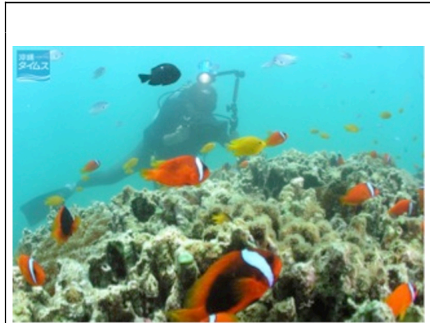
Oura Bay, July 2014, as seen by photographers from Okinawa taimusu

environmental assessment). 8 In mid-2014, Abe let it be known that he was contemplating dispatch of the same warship to the same Northern Okinawan waters. 9 This time it seemed the deployment would be overt. Determined not to allow any ambiguous or humiliating (to the state) outcome, he would mobilize all available forces.