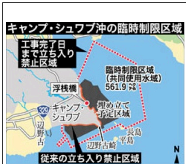
The Oura Bay Maritime Exclusion Zone (dotted red line) and the planned construction site (dark coloured) extending into the sea around the existing Camp Schwab Marine base. Henoko fishing port is marked at bottom left, beneath the “329” sign

confines of the existing Camp Schwab base and declaring an exclusion zone covering just over half of Oura Bay (561 hectares) preparatory to undertaking the reclamation. This maritime zone stretched the existing 50 metres exclusion zone around Camp Schwab to over two kilometres from the shoreline. Within that zone, 160 hectares of sea fronting Henoko Bay to the East and Oura Bay to the West were to be reclaimed and a mass of concrete to be imposed upon it, towering 10 metres above the surrounding sea and containing two 1,800 metre runways, a deep-sea 272 metre long dock and a complex of other facilities to be imposed upon it. Steamrolling the Okinawan people’s consistently expressed opposition, and without consultation or even prior notice, the Abe government appropriated half of one of Japan’s most precious nature zones for the construction of an American super base.