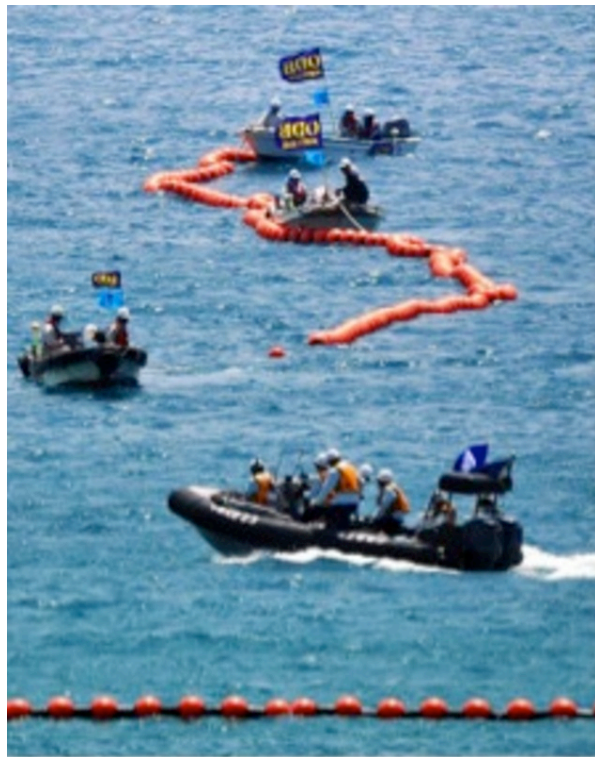
Coastguard rubber speed boats protecting the laying of a floating barricade by Okinawa Defense Bureau work teams, Henoko, 14 August 2014