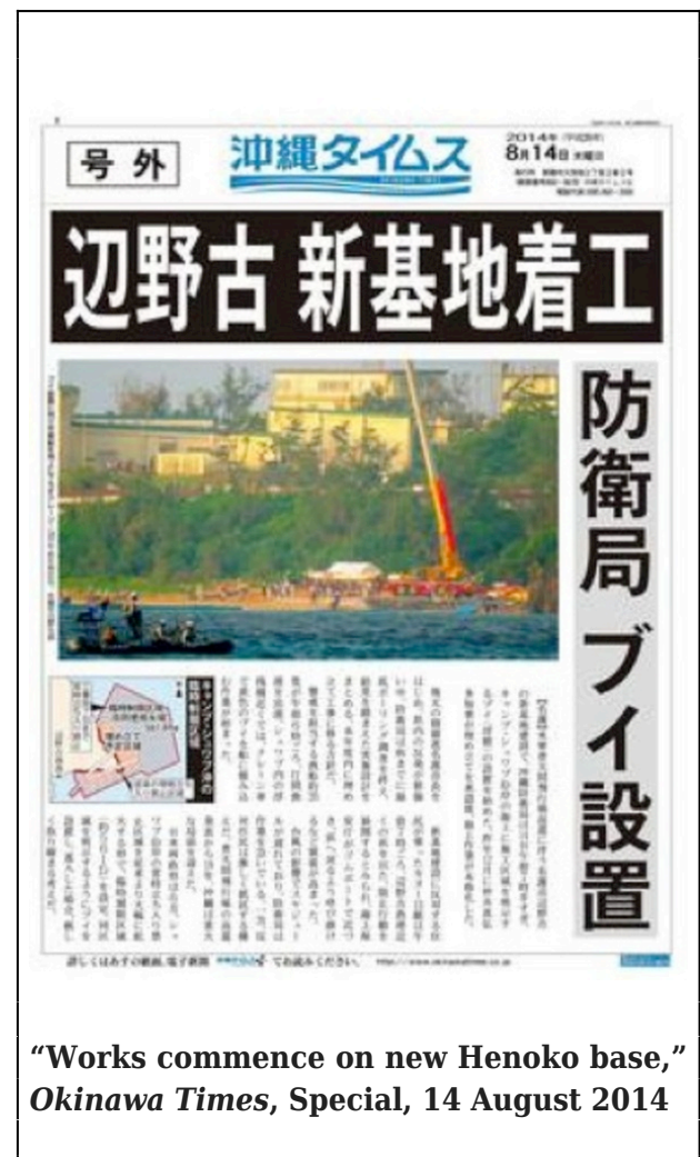
"Works commence on new Henoko base," Okinawa Times, Special, 14 August 2014

Marine base at Henoko. The national government launched a blitz-like campaign, proceeding with maximum speed and by the mobilization of formidable resources. The fact that it had taken one and a half years of the second Abe Shinzo government to get to this start is testimony to how difficult it is. The first great obstacle was securing the consent of Okinawan Governor, Nakaima Hirokazu, to reclamation of the waters of Oura Bay. That took one full year.