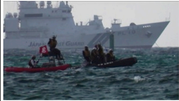
Anti-base canoeists vs the Japanese state's Coastguard ship on Oura Bay

Between 1996 and 2014, non-violent Okinawan resistance at Henoko blocked all attempts at base construction. Through the democratic means open to them – resolutions of village, town, and prefectural representative bodies – Okinawans had made their opposition clear, culminating in the January 2013 Kempakusho and in the Nago City elections of January 2014 in which the anti-base Inamine Susumu was re-elected by a substantial margin despite a massive Tokyo campaign to unseat him. Governor Nakaima's submission notwithstanding, therefore, base construction could only proceed by overruling the opposition of the Okinawan people, which meant in particular the opposition of Nago City and its mayor.