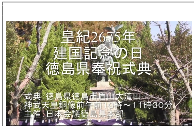
“Ceremony to Celebrate the 2675th Anniversary of the Foundation of the Nation in Tokushima” (Tokushima, Bizan Park, February 11, 2015).

continue to play an important role for advocates of a mytho-historical nationalism until today.