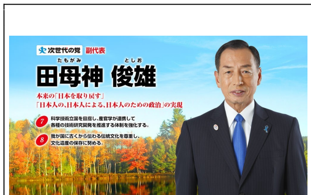
Website of Tamogami Toshio as Deputy President of the Party of the Next Generation (2015).

defense policy, and on Abe Shinzō himself. In a book titled “Tamogami’s Army of the Land of the Gods,” he claimed that Japan should have the right to collective self-defense and should arm itself with nuclear weapons, aircraft carriers, AEGIS destroyers armed with nuclear missiles, and long-range bombers (Tamogami 2010). In order to finance the vastly increased defense expenditure this would entail, he suggested cutting the child allowance (ibid.: 206). In “On Abe Shinzō,” he praised Abe for being “one of the few politicians who is not obsessed with the masochistic view of history” (Tamogami 2013: 9 and ch. 2). In contrast, he judges those politicians who favor a conciliatory approach to foreign policy as “prime ministers destroying Japan,” singling out former Prime Ministers Fukuda Takeo, Nakasone Yasuhiro, Obuchi Keizō, Miyazawa Kiichi and Hosokawa Morihiro (ibid.: 77-90).