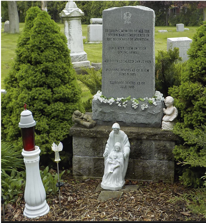
Figure 4. Grave of the unborn fetus (1973), Church of the Assumption Grotto.

and French origins. Interestingly, the grotto and the church grounds sit on a World War I and World War II German military cemetery.