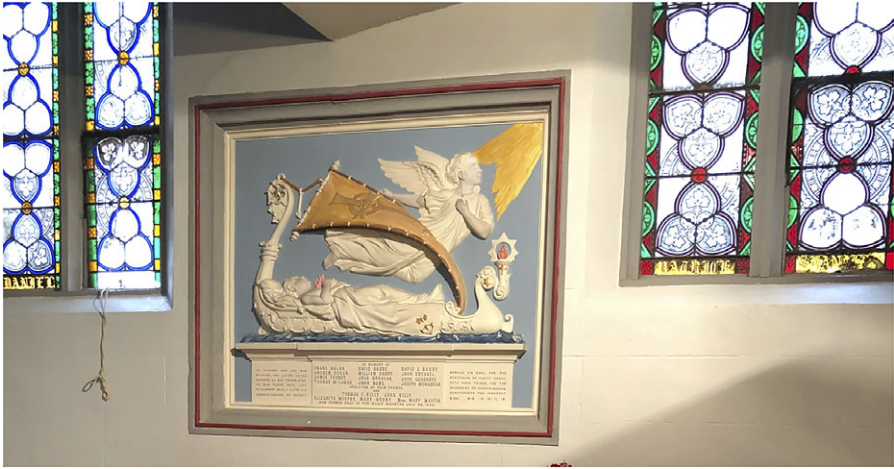
Figure 5. Holy Trinity Church.