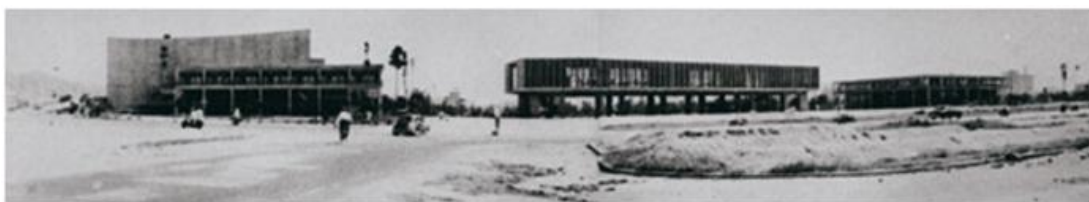
Hiroshima’s Peace Memorial Museum under construction in 1955