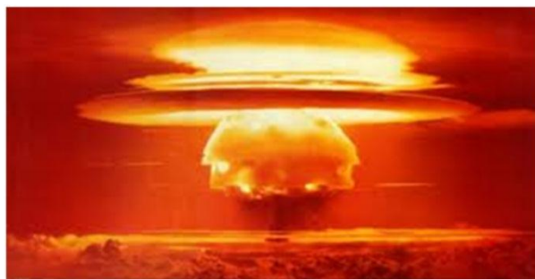
Bravo test at Bikini

The international community was appalled by the bomb test. Belgian diplomat Paul-Henri Spaak warned, "If something is not done to revive the idea of the President's speech -- the idea that America wants to use atomic energy for peaceful purposes -- America is going to be synonymous in Europe with barbarism and horror." Indian Prime Minister Jawaharlal Nehru declared that US leaders were "dangerous self-centered lunatics" who would "blow up any